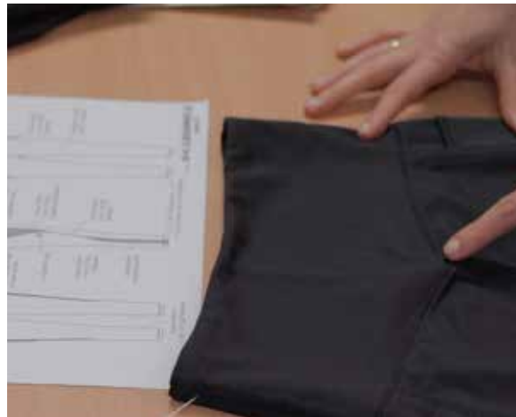
Gym+Coffee Leggings Launch