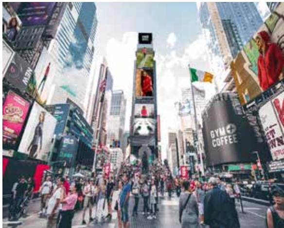
New York Fashion Week Launch Event