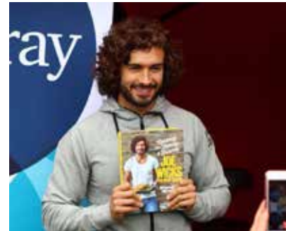
The Bodycoach in our Classic Grey hoodie :)