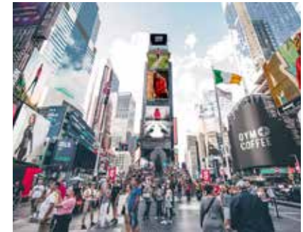
Launching in the US!