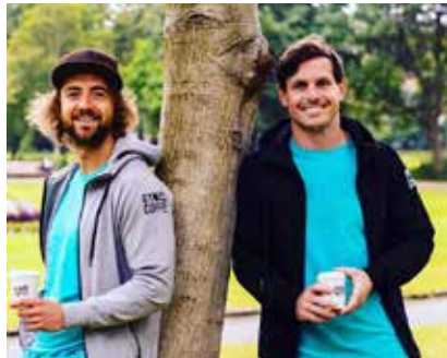
6 months in business was a big one!

We still get so excited everytime you guys like our posts. Thanks for all the support!