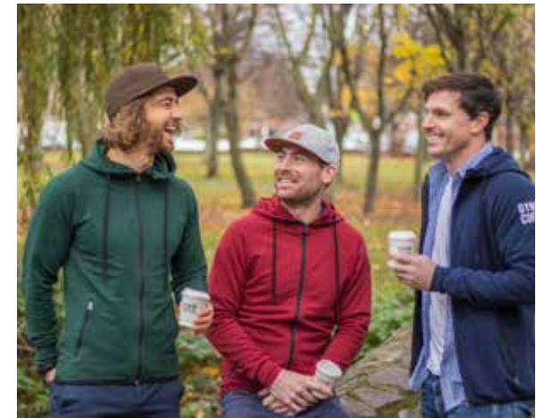
Gym+Coffee New Hoodie Colours