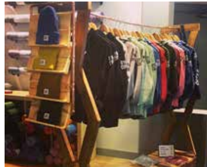
Our first retail space woohoo! Thanks Yoga Dublin!