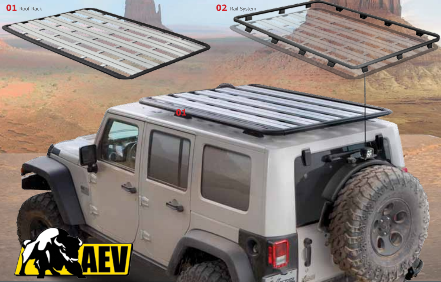
02 Rail System

Provides 5" of clearance above rain gutter. Perfect and secure fit even on very narrow gutters. Designed with vibration-damping, anti-slip vinyl coating. Galvanized stamped steel construction with black polyester powder paint. One Key System-Can be locked with four lock cylinders. Hardtop only with rain gutter / rail.