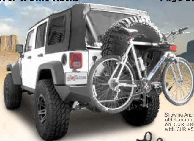
Showing Andreas' old Cannondale on CUR 18019 with CUR 45791