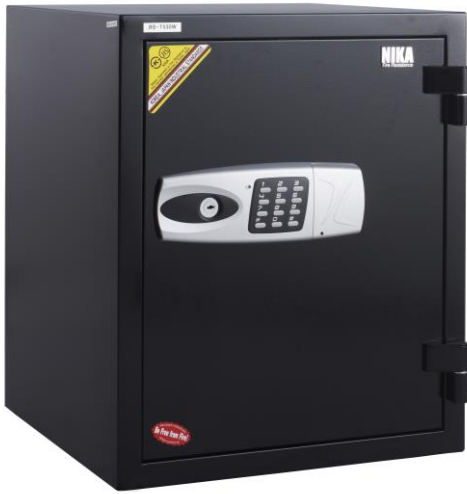
NIKA NT530 BLACK / WHITE Price: $749