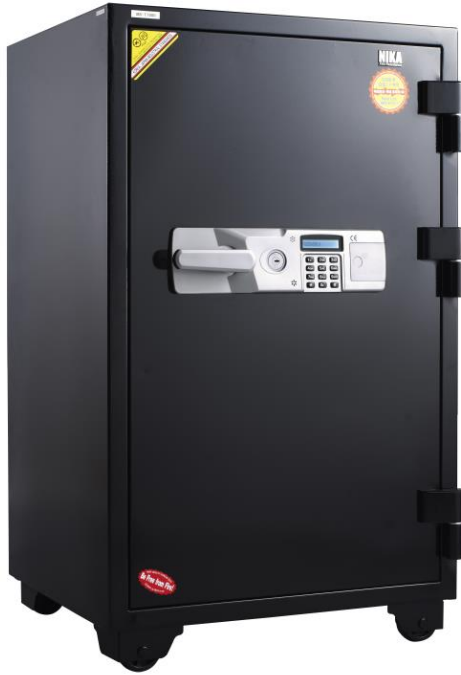
NIKA T1200 BLACK Price: $2399