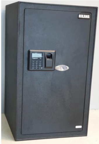
NIKAWA BIOSAFE 60FPD Price: $649