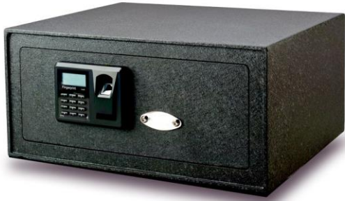
NIKAWA BIOSAFE 20FPDW Price: $449