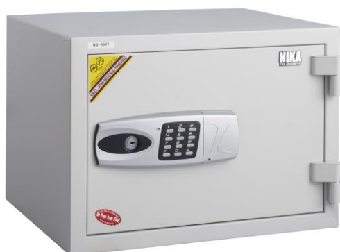
NIKA NT360 BLACK / WHITE Price: $599