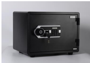
NIKAWA NX350 Price: $699

Operation: Fingerprint / Pin / Override Keys 30 Fingerprints 3-8 Digits Pin 3 x Override keys provided - External Battery Device to jumpstart (4 x AA Batteries) -2 x Hinge Side Dead Bolts -2 x Solid Locking Bolts -Fixed Shelf -1 hour Fire Rated Safe, Under 925°C -External: H325 x W420 x D350 mm* -Internal: H210 x W330 x D222 mm -Weight: 33kg, Volume: 15.38L -Free delivery to ground / lift level -2 years product warranty * Add additional 35 mm to depth