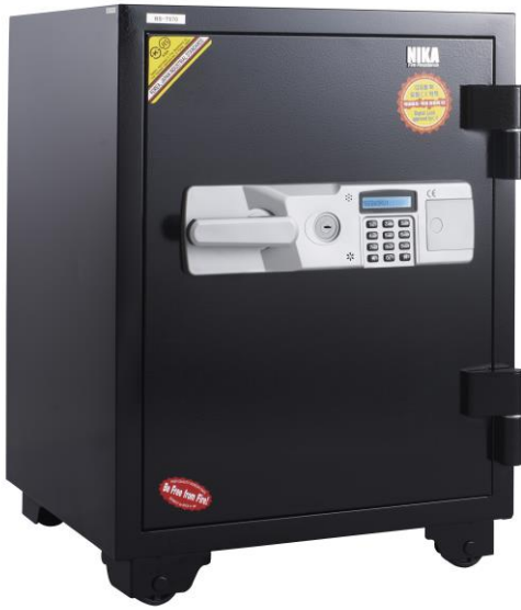
NIKA T670 BLACK / WHITE Price: $1130