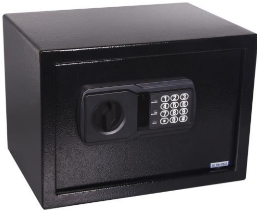
NIKAWA NEK 250 Price: $149