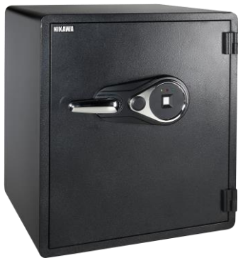
NIKAWA SWF 2420F Price: $1249