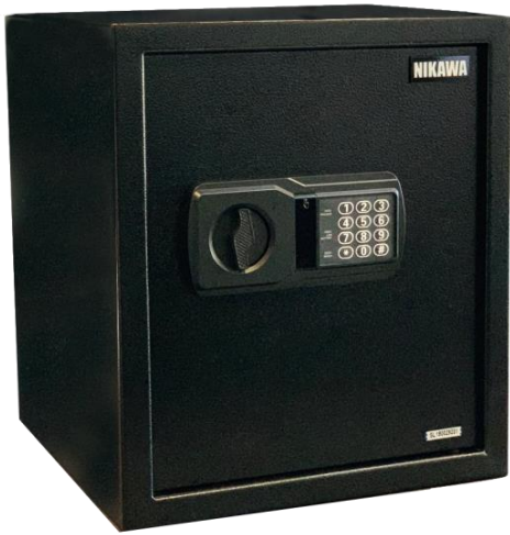
NIKAWA NEK 400 Price: $269