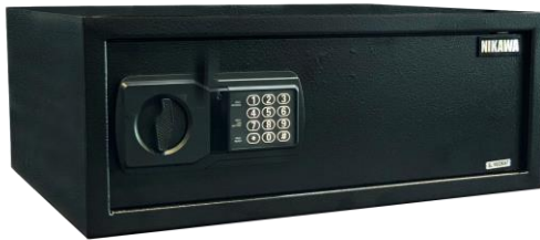
NIKAWA NEK 200 Price: $199