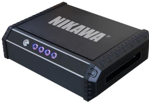
NIKAWA Flip Up Safe Price: $249