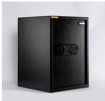
NIKAWA EIS500 Price: $349

Operation: PIN / Override Keys 2 Personal Pins – 3 to 8 Digits 2 x Override Keys Jumpstart using 9v battery Illuminated number pad Long colour status bar for better visibility 2 x 20mm Locking Bolts Colour: Black Exterior: H400 x W350 x D350 mm* Interior: H390 x W340 x D300 mm Volume: 39.78L Weight: 15KG Shelf: Yes Pre-drilled holes at the bottom and back Interior: Include the protective floor carpet 1 year product warranty *Add additional 15 mm to depth