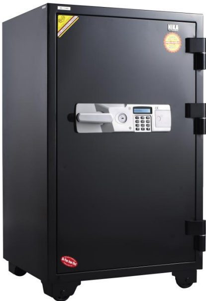
NIKA T1000 BLACK Price: $1940

Operation: Pin + User Key / Master Key 5 Personal passwords – 4 to 12 Digits Combination Password and User Key Operation External Battery Load Feature 2 hours Fire Rated Safe, Under 1010°C Able To Withstand A drop from a height of 9.1m 5 Locking Bolts, 3 Hinge Side Dead Bolts, 1 Drawer (lockable), 1 Shelf Time lock when wrong code entered Low Battery Indicator Ext: H880 x W590 x D510mm Int: H666 x W446 x D345mm Vol: 102.48 Litres Net Weight: 180Kg Made In Korea – Awarded Korea World Class Product Part Replacement Programme Free Delivery To Ground/Lift Level 2 Years Product Warranty *Add additional 50 mm to depth