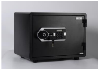
NIKAWA Nx300 Price: $549