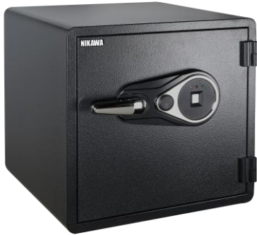
NIKAWA SWF 1818F Price: $1049