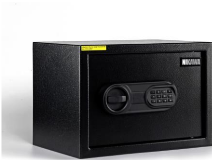
NIKAWA EIS250 Price: $149

Operation: PIN / Override Keys 2 Personal Pins – 3 to 8 Digits 2 x Override Keys Jumpstart using 9v battery Illuminated number pad Long colour status bar for better visibility 2 x 20mm Locking Bolts Colour: Black -Exterior: H200 x W520 x D380 mm* -Interior: H190 x W510 x D330 mm -Volume: 31.98L -Weight: 10KG - Shelf: No -Pre-drilled holes at the bottom and back -Interior: Include the protective floor carpet -1 year product warranty *Add additional 15 mm to depth