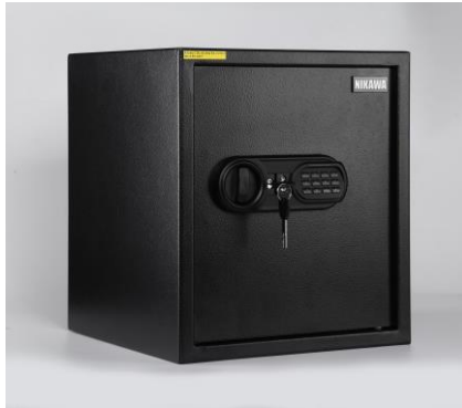
NIKAWA EIS400 Price: $269