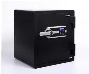
NIKAWA Nx530 Price: $849

Operation: Fingerprint / Pin / Override Keys 30 Fingerprints 3-8 Digits Pin 3 x Override keys provided -External Battery Device to jumpstart (4 x AA Batteries) -2 x Hinge Side Dead Bolts -2 x Solid Locking Bolts -1 x Tray -1 hour Fire Rated Safe, Under 925°C -External: H383 x W495 x D390 mm* -Internal: H250 x W390 x D253 mm -Weight: 45kg, Volume: 24.67L -Free delivery to ground / lift level -2 years product warranty * Add additional 35 mm to depth