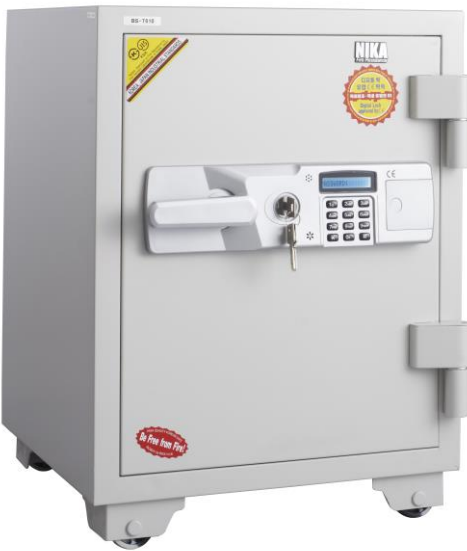
NIKA T610 BLACK / WHITE Price: $850

Operation: Pin + User Key / Master Key 1 Personal password – 4 to 12 Digits Combination Password and User Key Operation External Battery Load Feature 1 hour Fire Rated Safe, Under 925°C Able To Withstand A drop from a height of 9.1m 2 Locking Bolts, 2 Hinge Side Dead Bolts, 1 Drawer, 1 Shelf Time lock when wrong code entered Low Battery Indicator Ext: H520 x W435 x D440mm Int: H412 x W320 x D310mm Vol: 40.87 Litres Net Weight: 63Kg Made In Korea – Awarded Korea World Class Product Part Replacement Programme Free Delivery To Ground/Lift Level 2 Years Product Warranty *Add additional 25 mm to depth