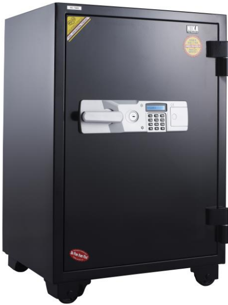
NIKA T880 BLACK Price: $1470