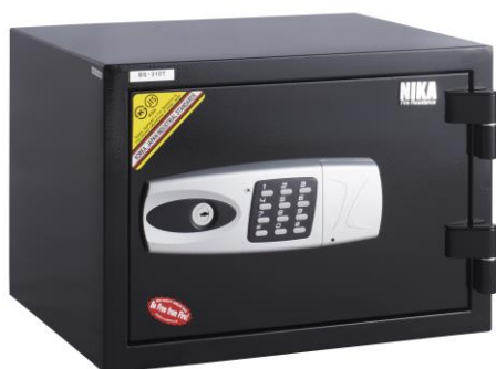
NIKA NT310 BLACK / WHITE Price: $449