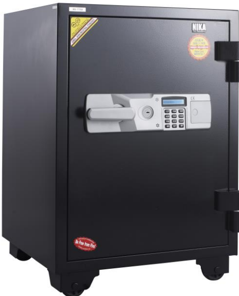
NIKA T750 BLACK Price: $1350