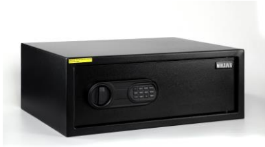
NIKAWA EISW200 Price: $199