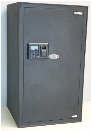
NIKAWA BIOSAFE 70FPD Price: $769