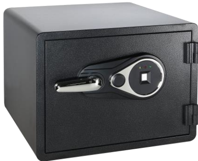
NIKAWA SWF 1418F Price: $899