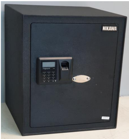
NIKAWA BIOSAFE 40FPD Price: $499