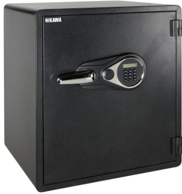
NIKAWA SWF 2420E Price: $999