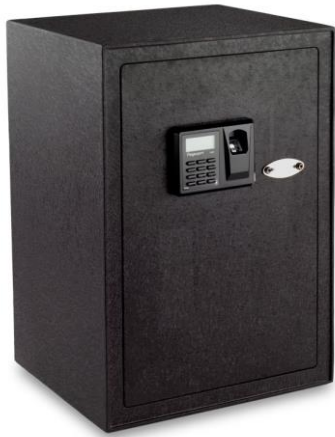
NIKAWA BIOSAFE 50FPD Price: $549