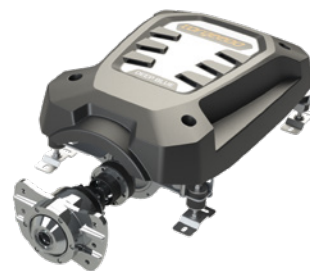
Deep Blue 100 i