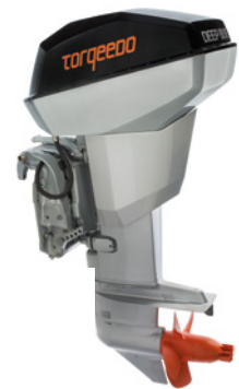
Deep Blue 25/50 R