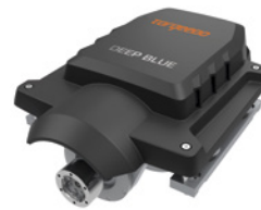
Deep Blue 25/50 i

This 100 kW motor was specifically constructed to power fast, planing motorboats. With a reliable, low-maintenance, direct-drive design, the Deep Blue 100i delivers extraordinary performance, with up to 2,700 RPM and a torque of 437 Nm.