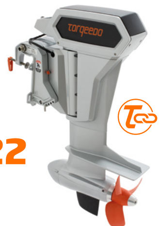
CRUISE 6.0 T/R*