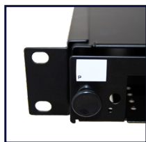
Easy Panel Identification Labelling