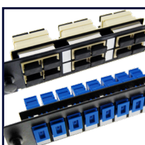
2 Tier Screw less Fibre Adapter Plates (Purchased Separately)