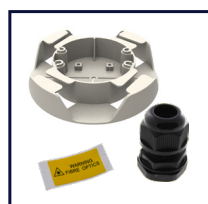
Supplied with Internal Cable Management Accessories & Cable Gland