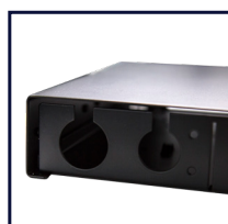
2x 20mm and 2x 25mm Rear Cable Gland Entry Points