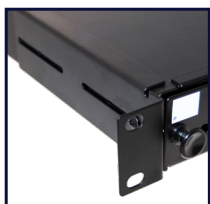
Telescopic Rackmount Brackets