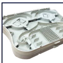
2x 24 Position Splice Cassettes