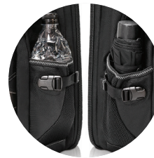
Magnetic quick-access and adjustable side pockets