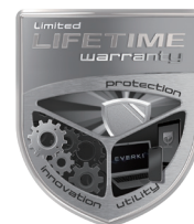
Limited Lifetime Warranty protection