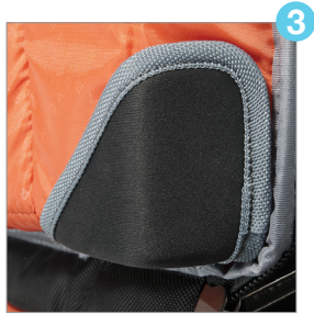
Patented corner-guard protection system