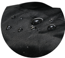
Water-repellent ballistic nylon exterior and weather cover