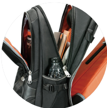
Spacious, well-organized compartments