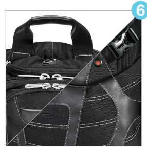
Premium leather handle and accents