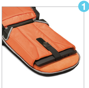
Travel friendly 17.3-inch laptop/tablet compartment