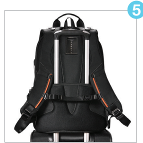
Trolley handle pass-through