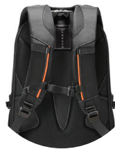
Ergonomic back panel and shoulder straps with weight distributing chest strap