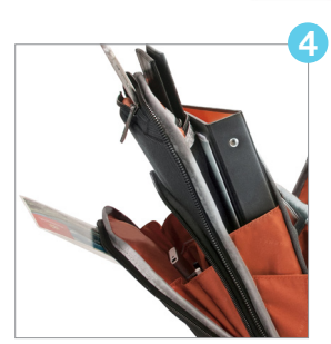
Front-loading quick-access file divider