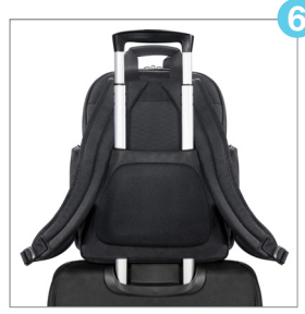
Trolley handle passthrough