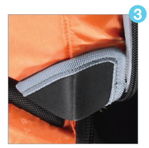
Patented corner-guard protection system