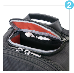
Hard-shell quick-access sunglasses case

Travel friendly 14.1-inch laptop/MacBook Pro 15 compartment