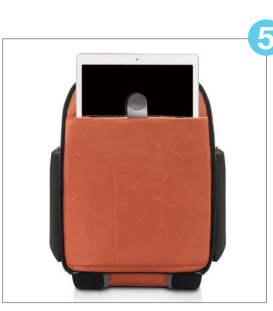
Felt-lined iPad/ Kindle/tablet pocket