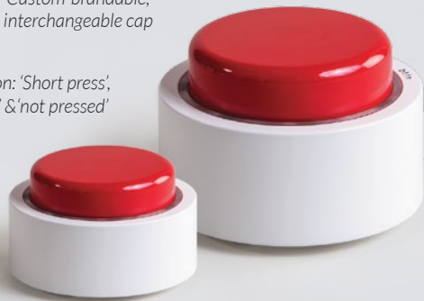
btt n Mini

Triple-action: 'Short press', 'long press' & 'not pressed'