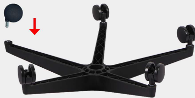
E - WHEELBASE