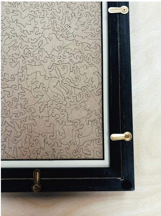
Turnbuckles on back, with mat