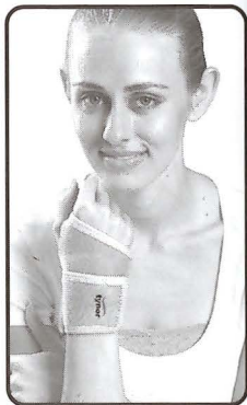
Wrist Brace With Thumb (Neoprene)