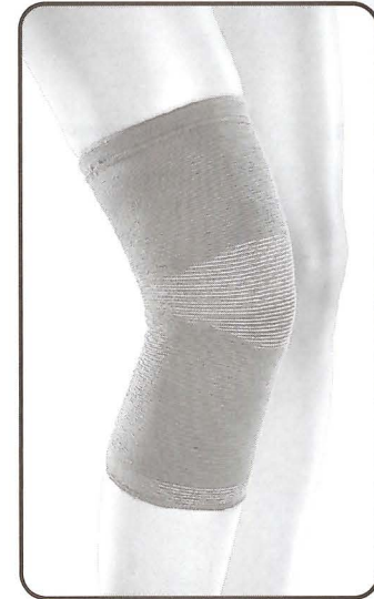
Knee Cap Comfeel