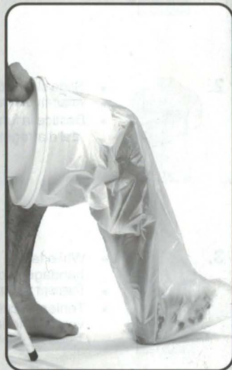
Cast Cover (Leg)