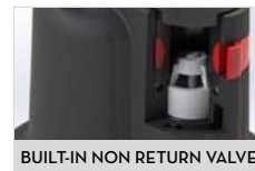
BUILT-IN NON RETURN VALVE