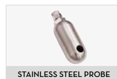
STAINLESS STEEL PROBE