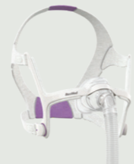
AirFit™ N20 Nasal mask for Her

AirFit N20 is available in Medium and Large sizes.