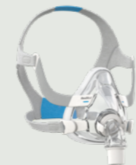
AirFit™ F20 Full face mask

AirFit N20 Classic is available in Small, Medium and Large sizes.