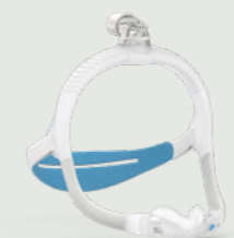
AirFit™ N30i Nasal cradle mask

AirFit N30i is available in Standard and Small. Both sizes come with Small, Medium and Small-Wide cushions. The Standard mask comes with a Standard size headgear and the Small mask comes with a Small size headgear.