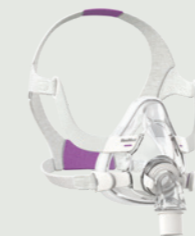
AirFit™ F20 Full face mask for Her

AirFit F20 is available in Small, Medium and Large sizes.