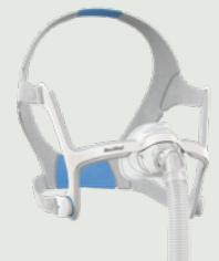
AirFit™ N20 Nasal mask

AirFit N20 is available in Medium and Large sizes.