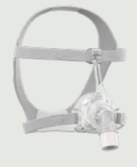
AirFit™ N20 CLASSIC Nasal mask

AirFit N20 for Her is available in Small size.