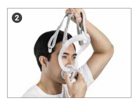
Place the cushion under the nose and against the face. With the ResMed logo and headgear facing up, pull the headgear over the head.