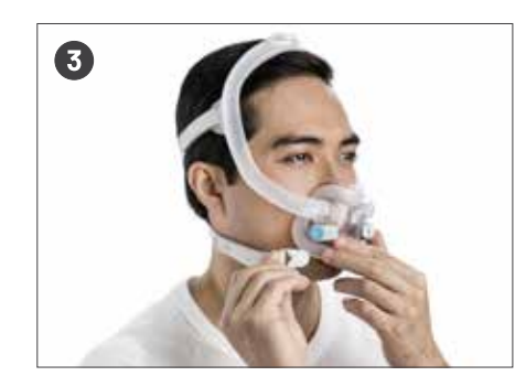
Bring the lower headgear straps under the ears and attach the magnetic clips to the frame connectors.