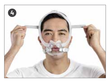
Undo the fastening tabs on the upper headgear straps and pull evenly.