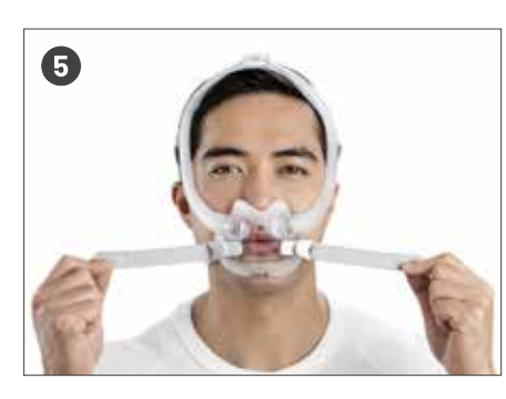
Repeat with the lower headgear straps.