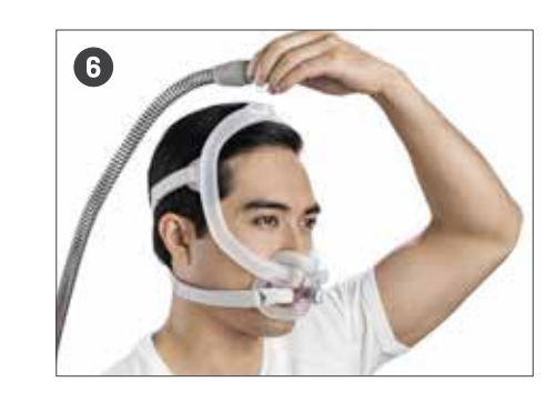
Squeeze the side buttons on the elbow and detach from the frame. Connect the air tubing from the device to the elbow, then reattach it to the frame.