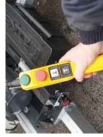
Electrical operation with creep speed (optional)