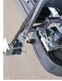
Interlocking, high-performance self-propelled drive (optional)