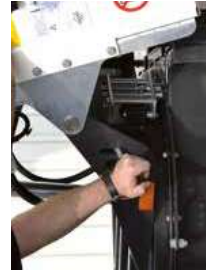
Adjustable turntable with mechanically releasable lock