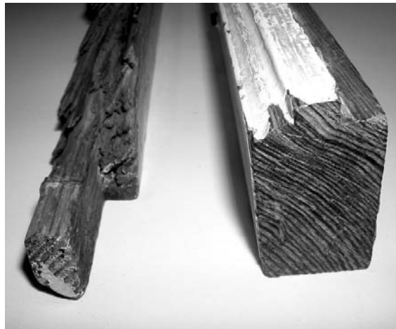
Figure 4 Window sections 15 years old (left) and 150 years old (right).

After the Second World War, people disregarded quality and ignored the lessons of the past. Today we have many problems with windows and doors that are no more than 10 or 15 years old (Figure 4). In order to save as much of the older, good-quality material as possible, we have rediscovered simple techniques for repairing sashes and frames. We use