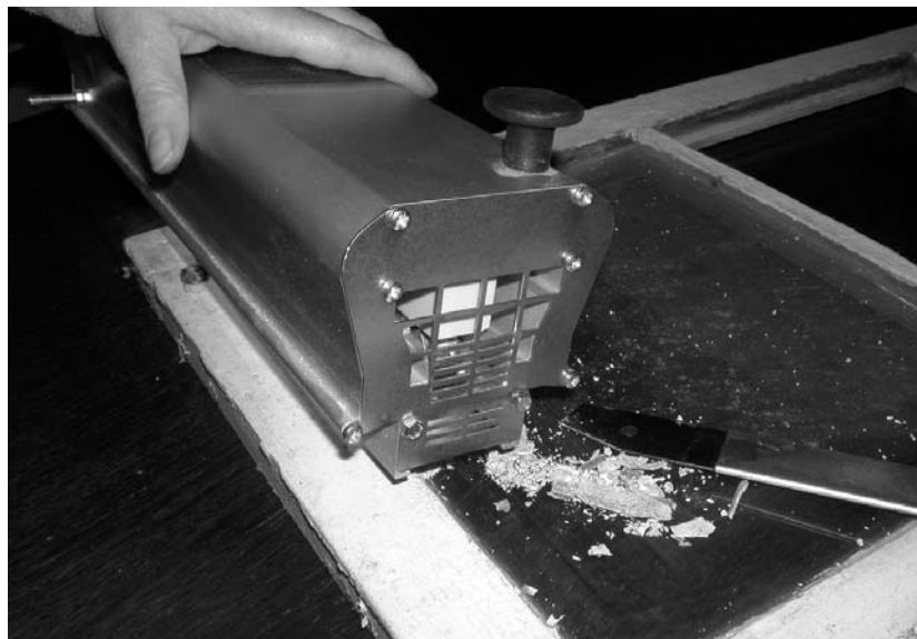
Figure 2 The putty lamp – an innovation by Sonja and Hans Allbäck.

We also found many useful hand tools and quality materials, including a hand-driven profile planer from the early eighteenth century. Even today we use this ‘machine’ to complement the work of modern machinery in renewing windows from that period (Figure 3).