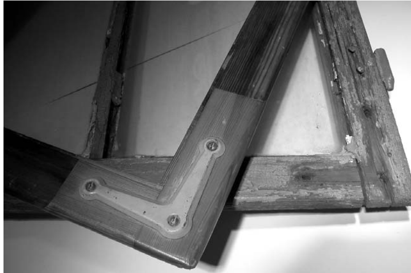
Figure 1 Windows from 1880, showing small-scale repairs.

Economics forced us to invent the simple weatherproof temporary window that made it possible to work all year around. We also made a small adjustable platform to reach windows at any height.