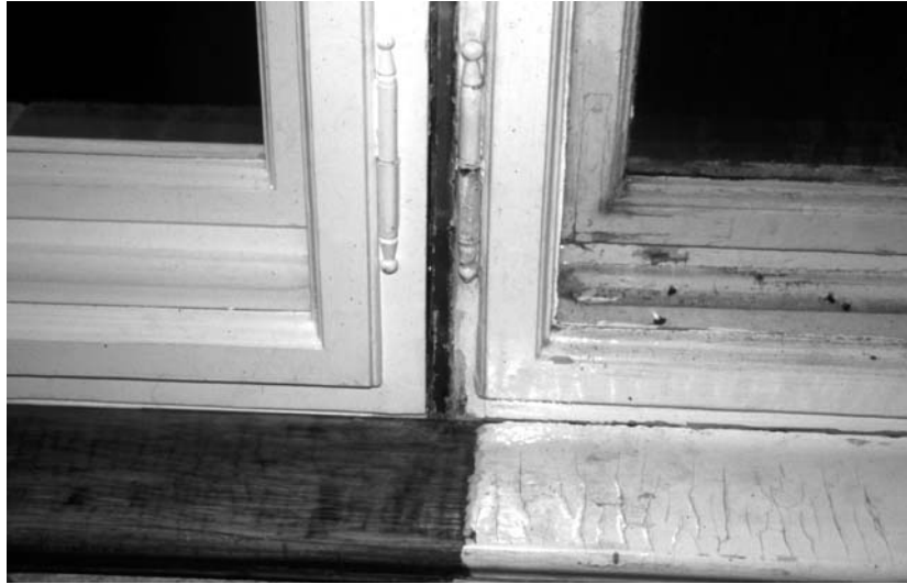
Figure 5 Window from 'Kastenfenster' in Leipzig dating from 1880.

completely removed. The outer and inner frames were fitted together and minor damage caused during transportation was repaired. After impregnation with raw linseed oil, the windows were re-glazed using linseed-oil putty of our own manufacture. Our goal was to keep the milled glass in the outer casements. As an experiment, we used 3 mm Pilkington Kappa Energy glass (K-Glass) in one of three inner casements, in order to show the differences in colour and light. Nobody noticed the difference.