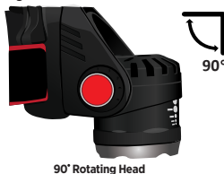
90° Rotating Head