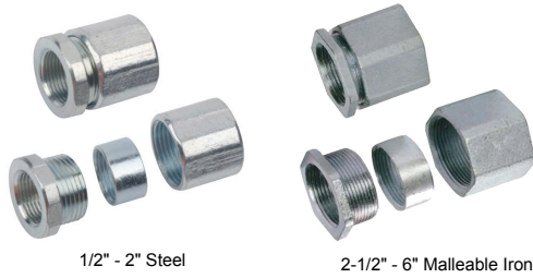
1/2" - 2" Steel