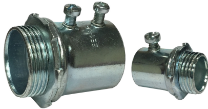
1-1/4" - 4"