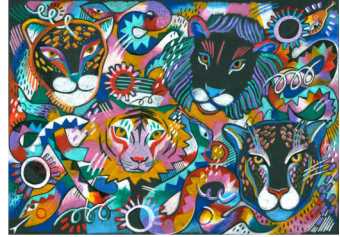
Amy Isles Freeman

30 x 40 cm Ballpoint pen, pencil colour on paper