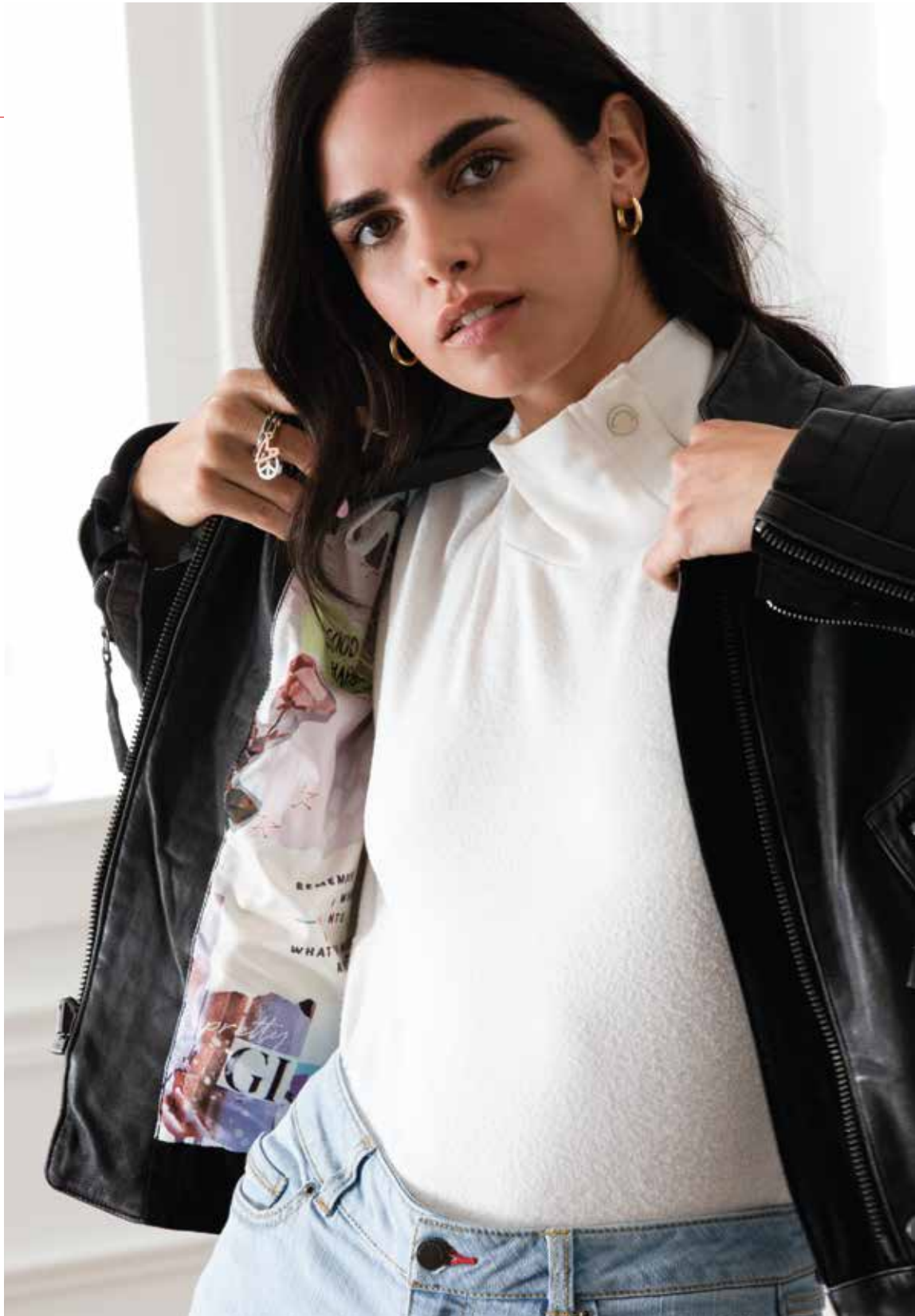
A375026 reversible leather jacket