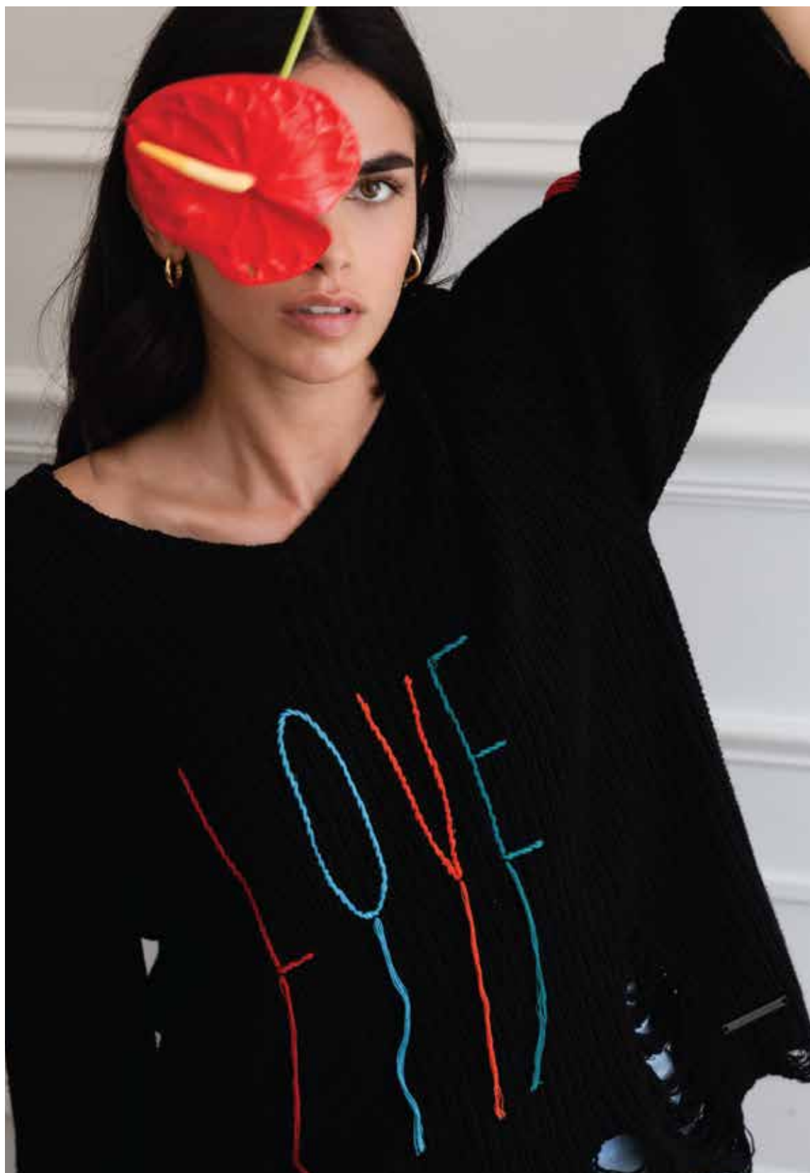
A375412 destructed affirmation v-neck sweater