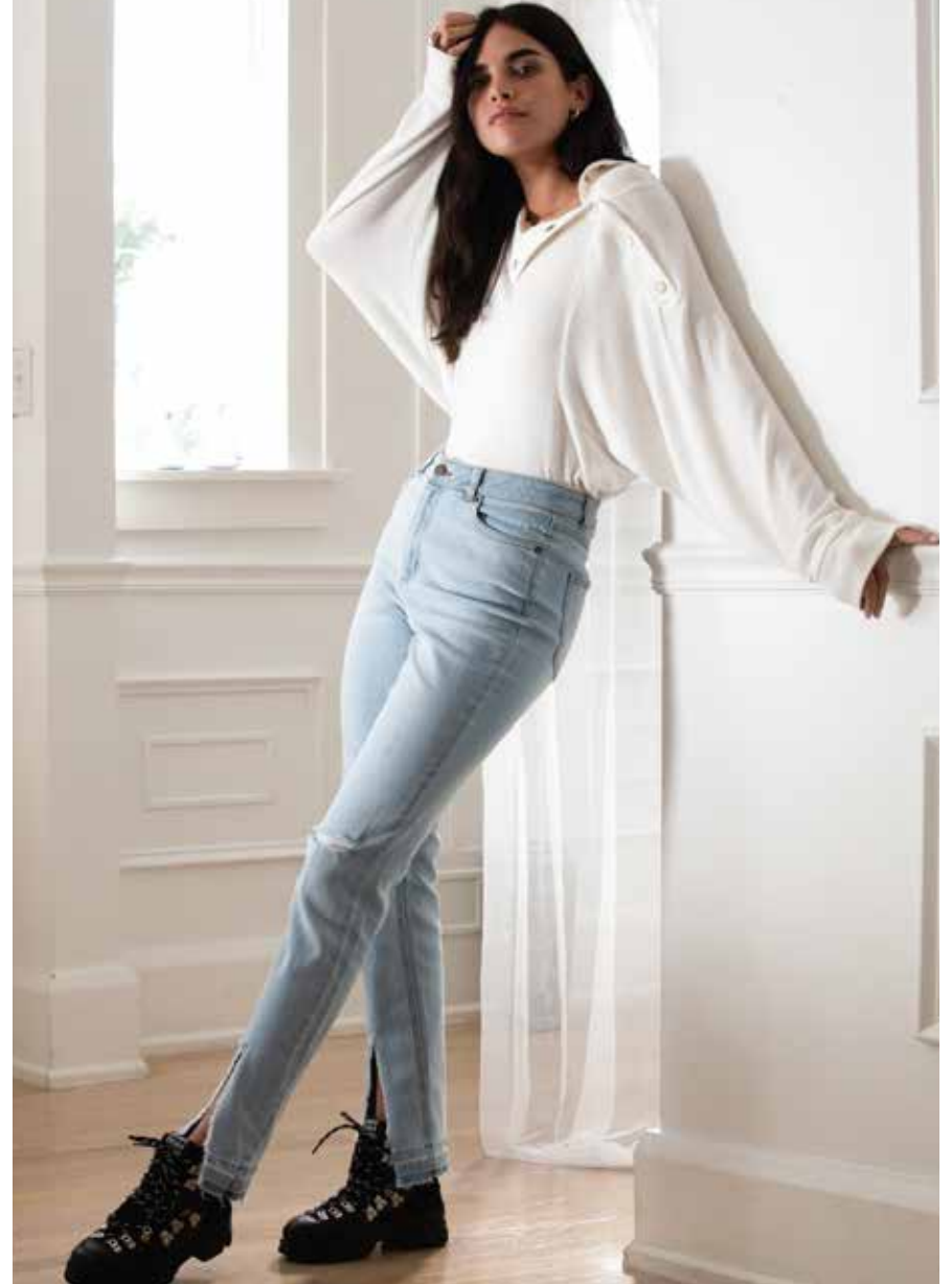
A375427 side neck snap comfy knit top