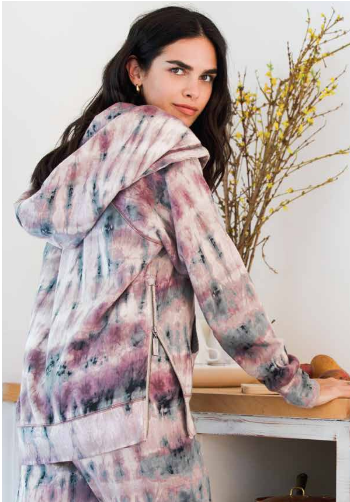
A376009 solid or tie dye cowl neck hoodie