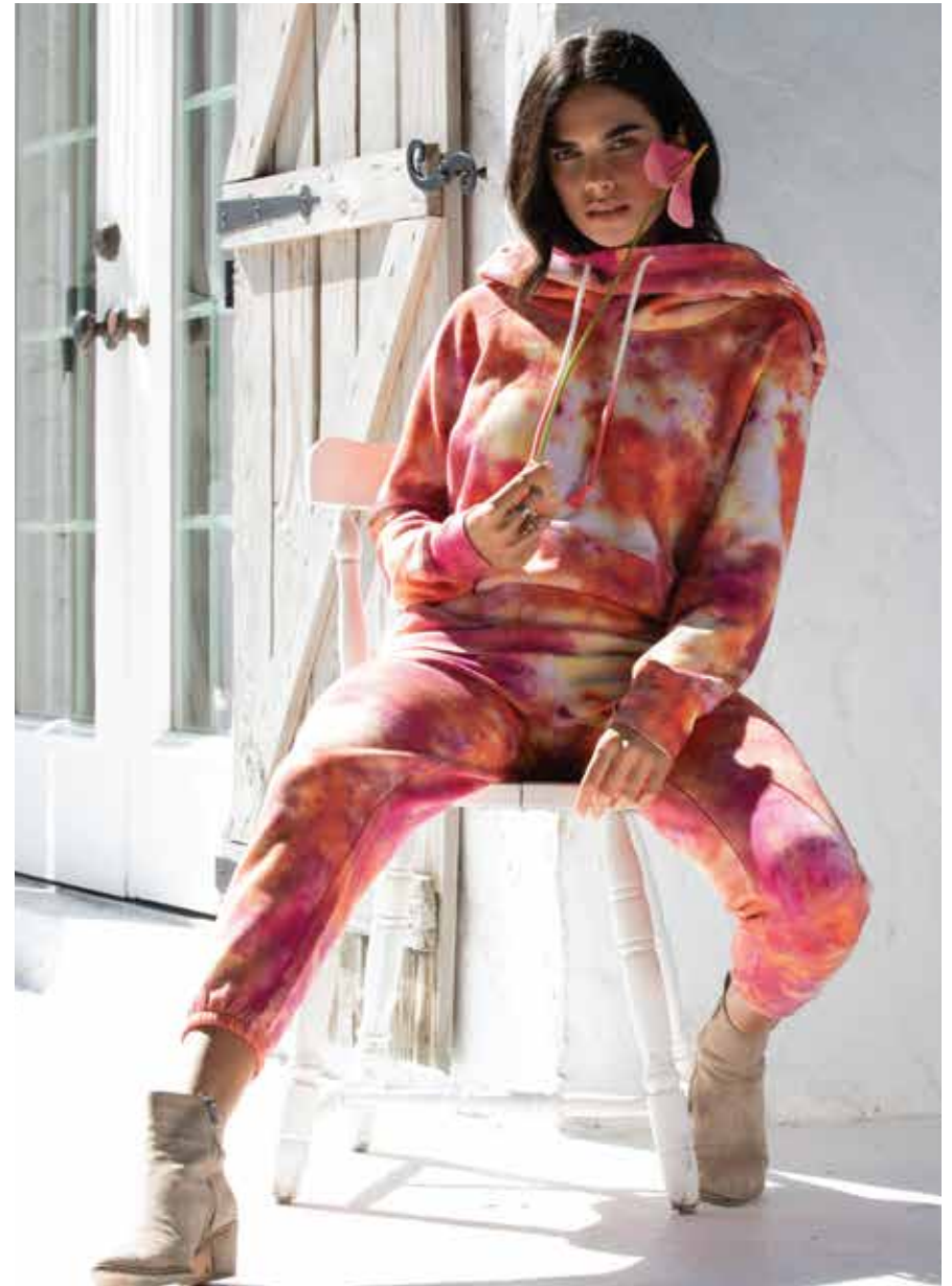
A376009 solid or tie dye cowl neck hoodie A376464 solid or tie dye jogger