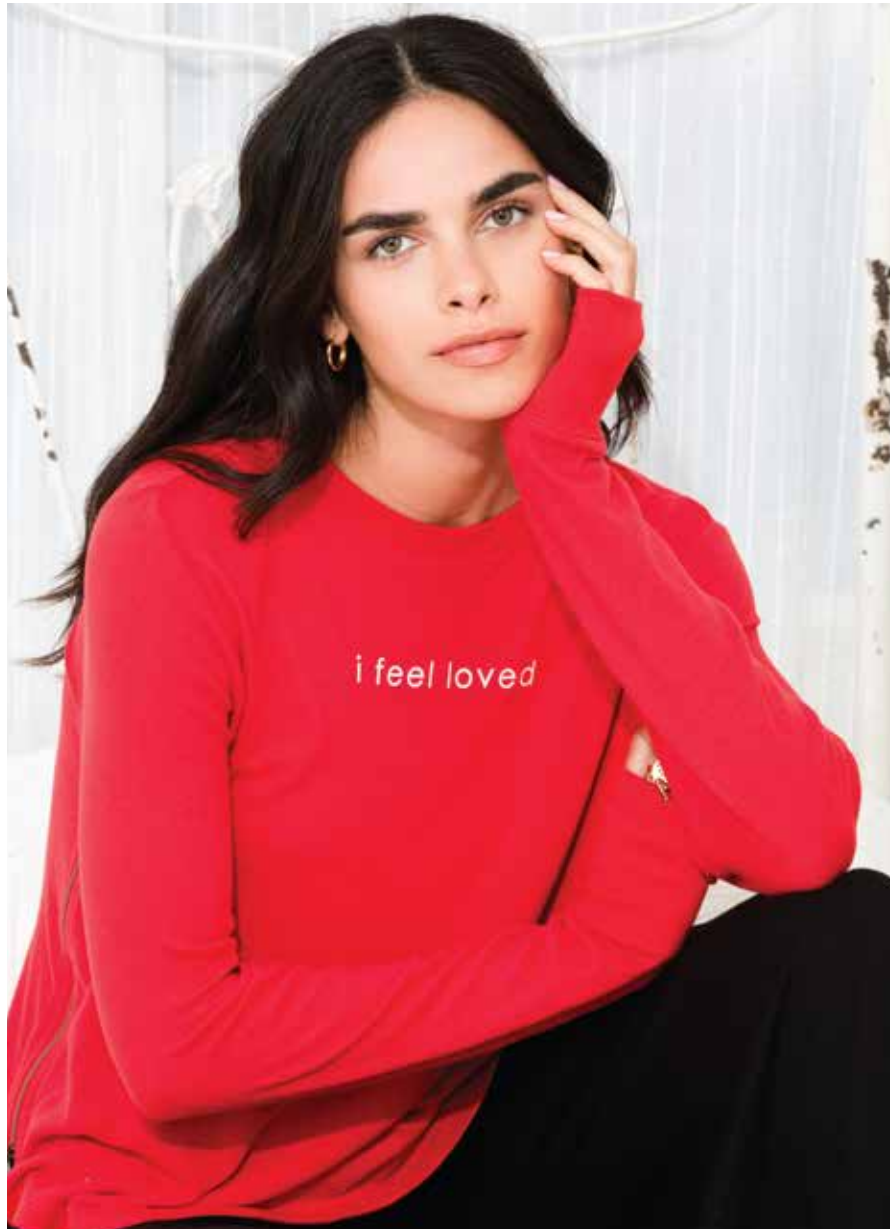
A375498 kris side zip comfy knit top