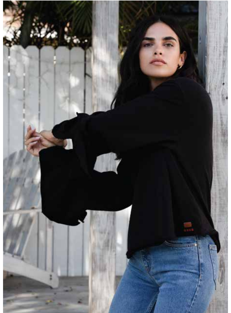
A376464 french terry flounce sleeve pullover