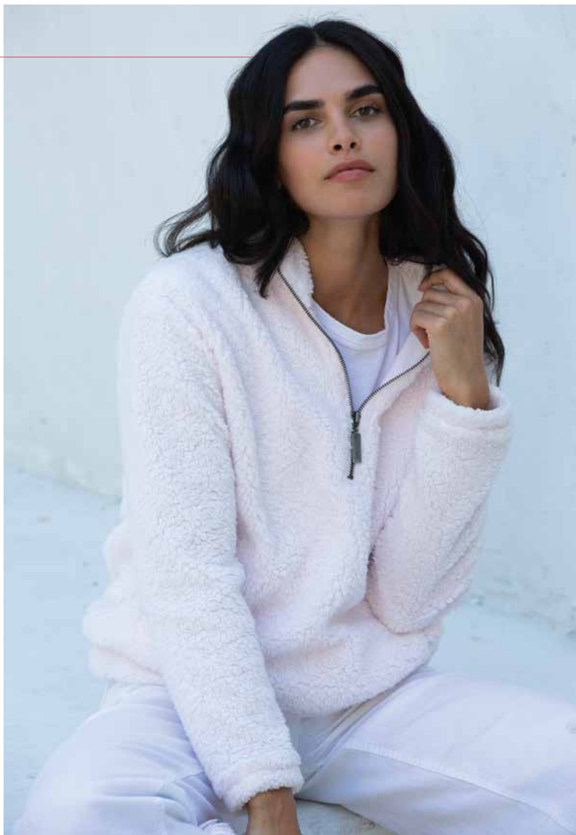
A374887 teddy fleece 1/4-zip pull-over