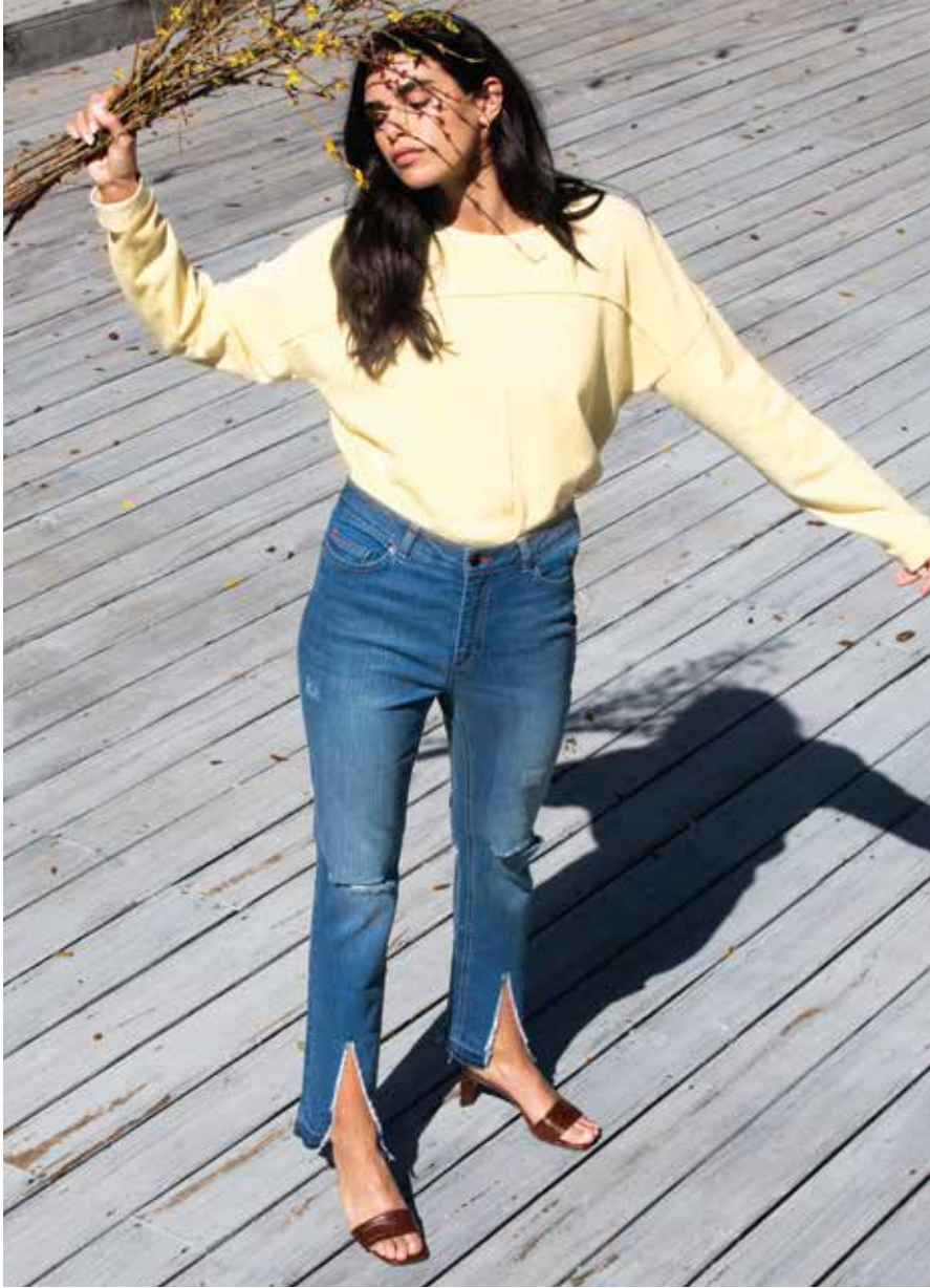
A376630 girlfriend front slit jean