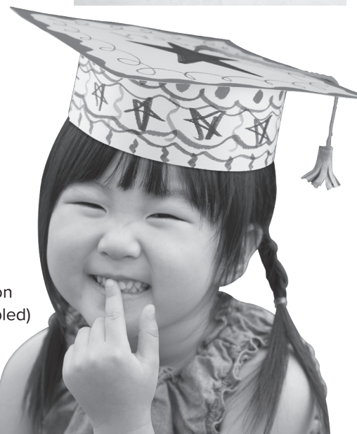
Hat-Graduation (H1004 - Assembled)