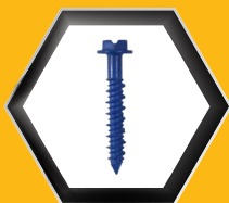
Masonry Screws (Tapcon)