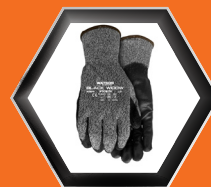
Personal Protection Equipment (PPE)