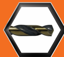
Metal Drill Bits