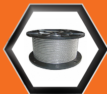
Aircraft Cable and Accessories