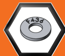
Structural Washers F436