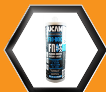
Anchoring Adhesive (DeWalt, Ucan)