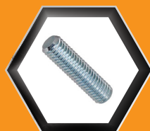
Threaded Rods A307, A193-B7, Stainless Steel