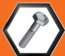
Structural Bolts F3125 A325 Plain and Hot Dipped Galvanized