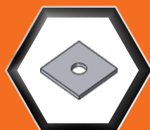
Custom Plates Grade 50/350W and CHT400