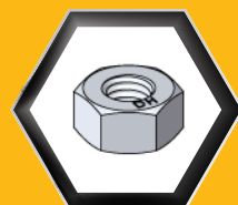
Structural Nuts A194 2H and A563 DH