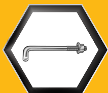
F1554 GR 36,55 and 105 Anchors (Headed, Bent, Double End, Single End)