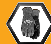
Personal Protection Equipment (Hard hats, Cut Resistant Gloves, Safety Glasses)

As a public utilities contractor, you require more than a supplier: you require a partnership that you can trust and will strive to comply with tight lead times and precise specifications.