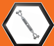
Lifting and Rigging