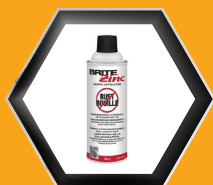
Brite-Zinc (Meets ASTM-A780 for corrosion Protection)