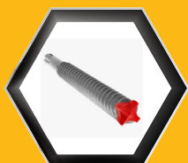
SDS+ and SDS Max 4 Cutter Bit