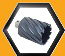
Annular Cutters and Drill Bits