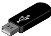
USB File Storage