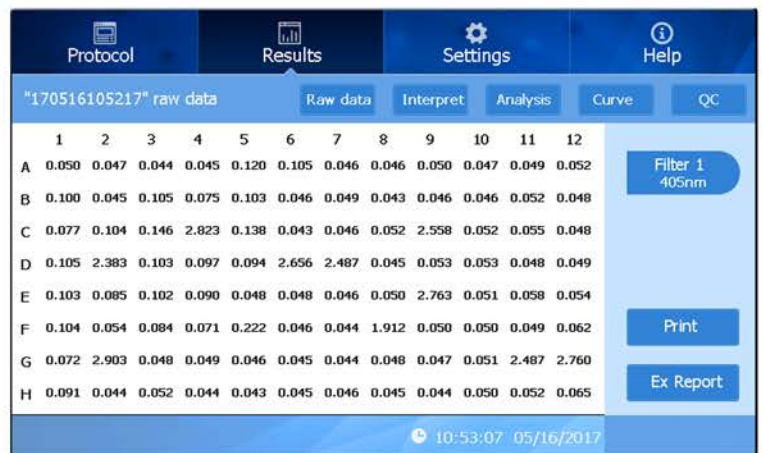
Reading Results Screen

Measurement data is available immediately on the screen after a reading, as well as interpretations, calculated analysis and curve fittings.