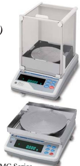
MC Series with auto-centering pans

Please also visit our video library at www.aandd.jp to see how it operates!