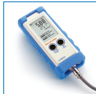
HI 710024 Shockproof Rubber Boot, Blue