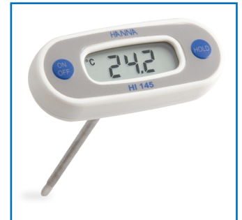
HI 145-30 Digital Thermometer with CAL CHECK®, -50.0 to 220°C, 300mm (11.8 in)