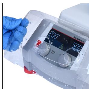
In Use Cover