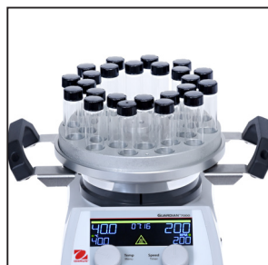
Base Plate and Handles