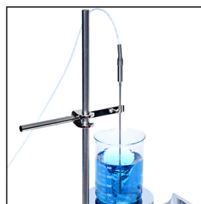
Support Rod and Clamp Kit