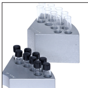
Vial and Test Tube Blocks