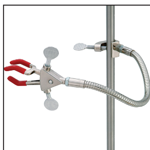
Ultra Flex Support Kit