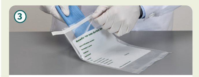
Put the swab into the sterile Twirl-Tie ^{\rm TM} bag and label bag with sample details. Always switch gloves between sampling sites.