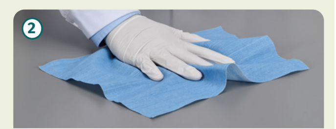
Collect sample by vigorously rubbing sponge on targeted area (e.g. 30 x 30 cm, 1 x 1 ft.).