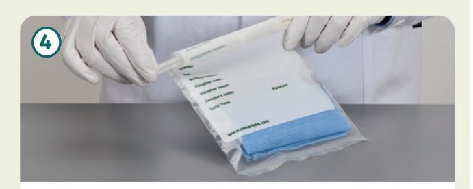
Close the Twirl-Tie™ bag with the wires attached.