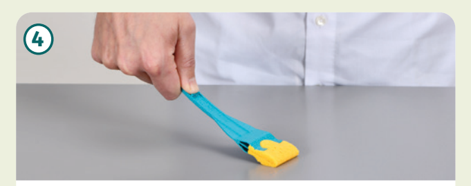
Collect the sample by vigorously rubbing sponge on target area (e.g. 30 \times 30 cm, 1 \times 1 ft). Sponge-sticks are not recommended for the sampling of rough surfaces, as friction might cause the sponge to be released from the stick.