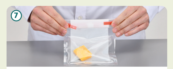
Use the attached tie to close the Twirl-Tie ^{\rm TM} bag by rolling the opening of the bag and then kinking the tie to the inner side.