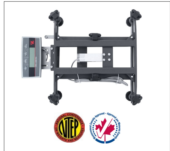
Sturdy powder-coated steel frame holds up to heavy daily shipping use