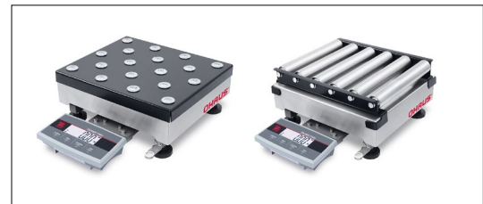
Ball Top and Roller Top Platform Options