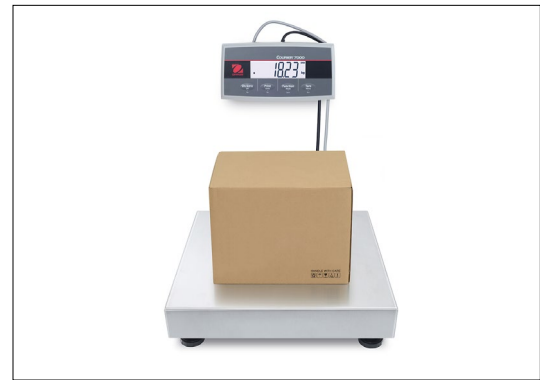
Integrates with shipping system software

The large, bright display clearly shows weights in dimly-lit warehouse and loading dock areas. The indicator comes base mounted but can be attached to a column for display above the platform. A second Remote Display and column can be used to show the results for added verification.