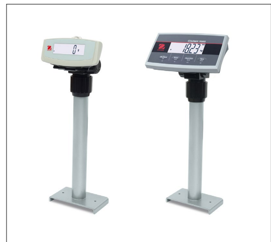
Optional Remote Display on column mount and Column Mount for scale indicator available