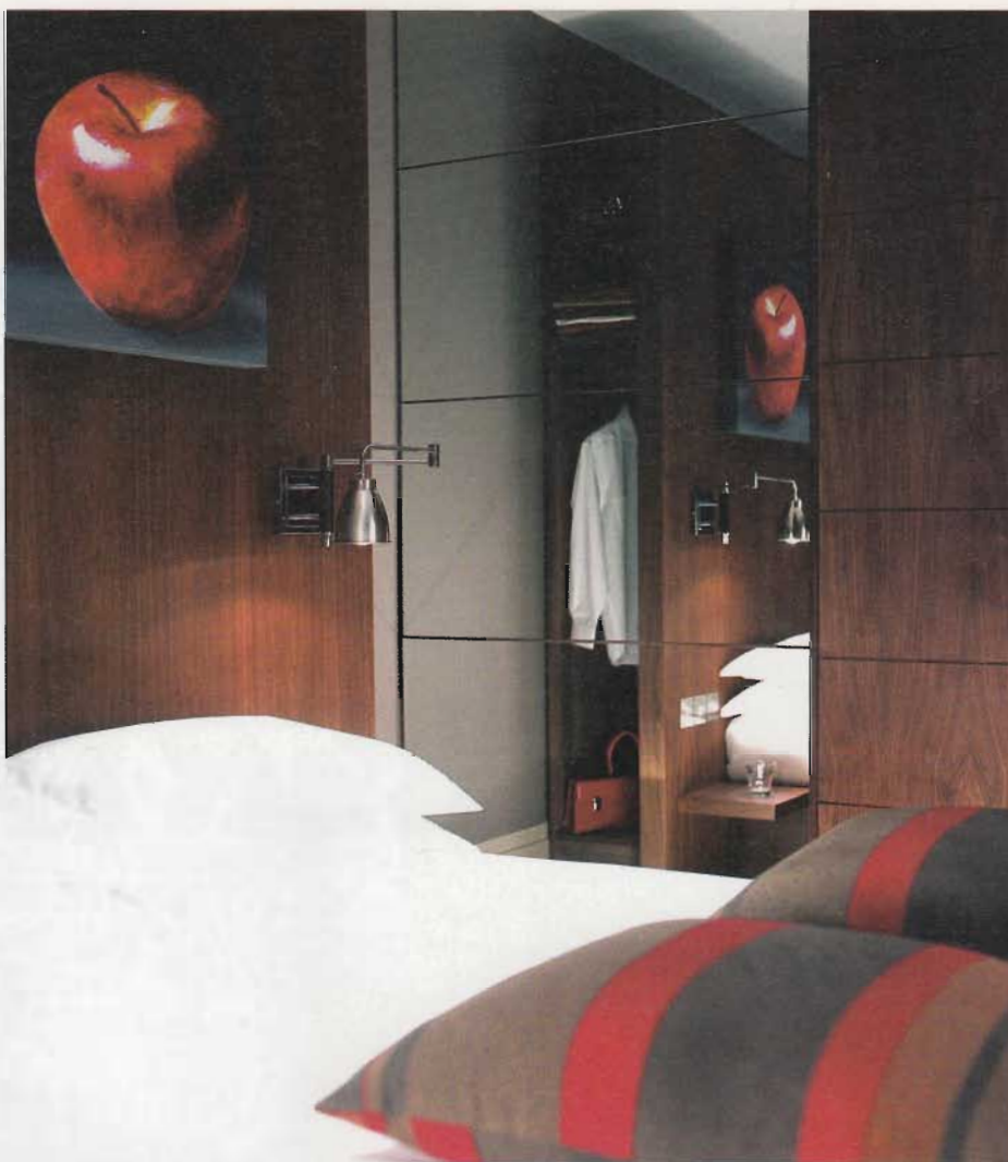
The Dakota in Nottingham is the first in what McCulloch intends to be an extensive chain across Britain

He spent three years on a search for suitable locations in Paris, Lisbon, Dubai and the USA but gave up after Wall Street ambiva-