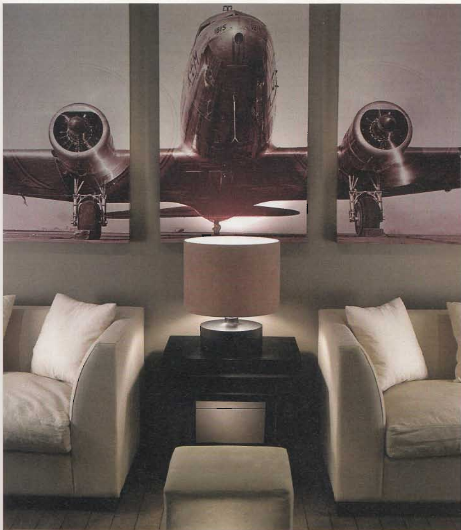
Dependable and ubiquitous, the Dakota aircraft is a perfect mascot and model for the hotel chain to follow