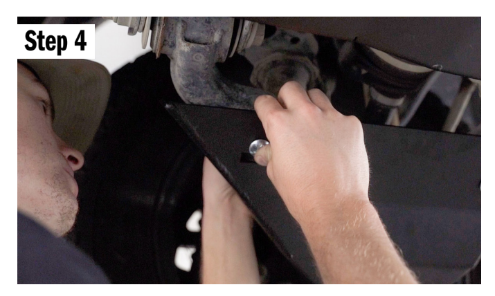
Using the longer 3/8 carriage bolt, place it into position towards the rear of the skid plate. Push it through the lower control arm and put on a washer and a nut. Hand tighten.