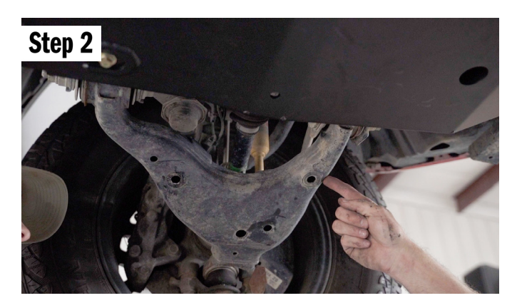
Locate the holes that align with the Lower Control Arm Skid.