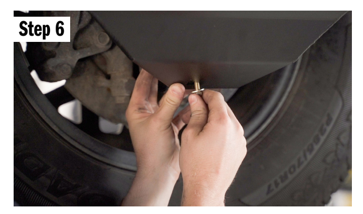
Use the 1/4" bolt, add a washer, push the bolt through the skid and through the aluminum spacer. Note: Only the 2nd Gen Tacoma will require the aluminum spacer.