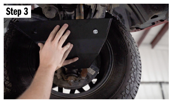
Using the shorter 3/8 carriage bolt, place it into position towards the front of the skid plate. Push it through the lower control armand put on a washer and a nut. Hand tighten.