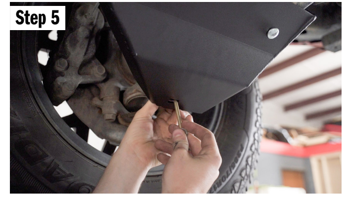
Place the aluminum spacer between the skid plate and the lower control arm.