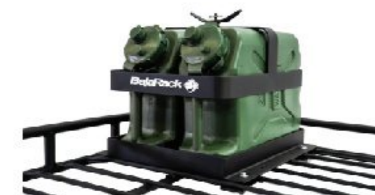
Water Can Holder