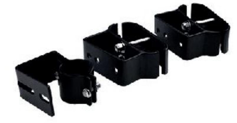
Awning mount for Toyota FJ factory rack