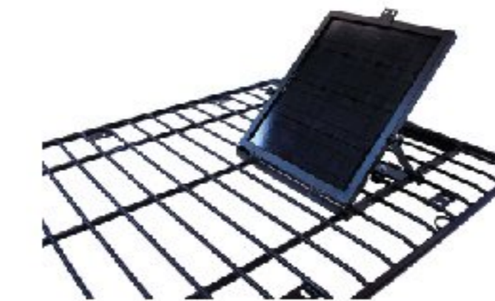
Solar panel mount