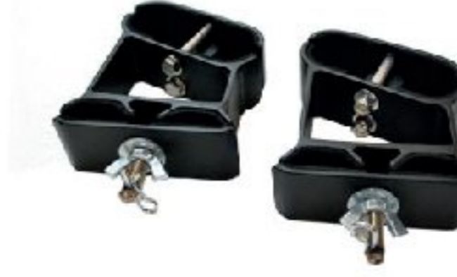
Axe & Shovel mount for Toyota FJ factory rack