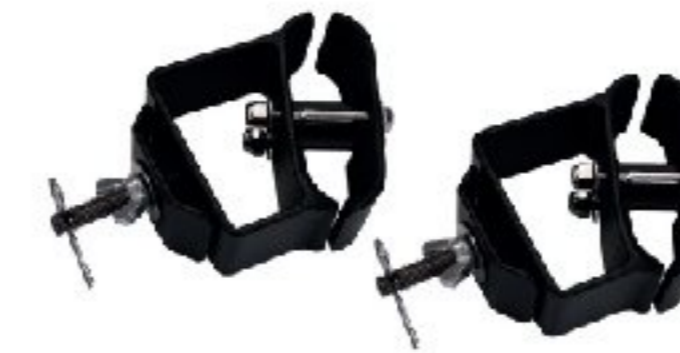
Hi-Lift mount for Toyota FJ factory rack