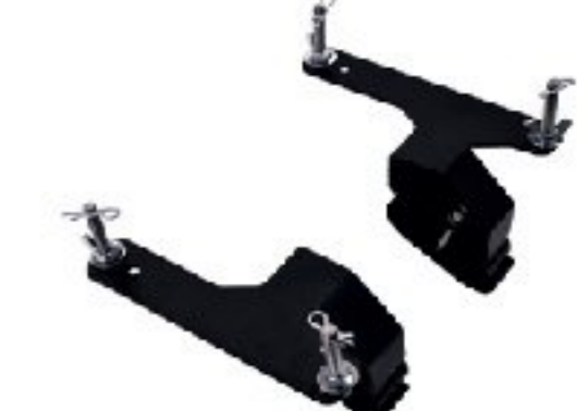
Maxtrax mount for Toyota FJ factory rack