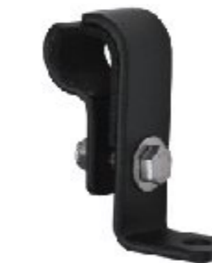
Light Clamp mount