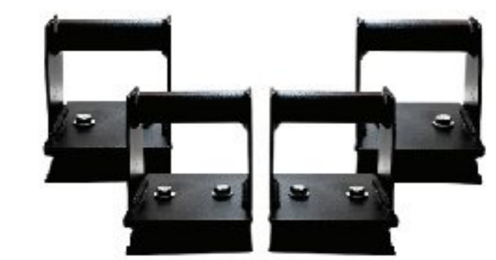
Yakima & Thule Accessory mount (4 pieces)