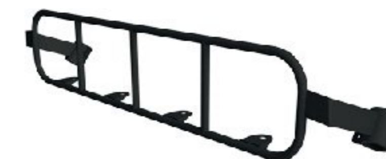
Light Bar for Toyota FJ factory rack