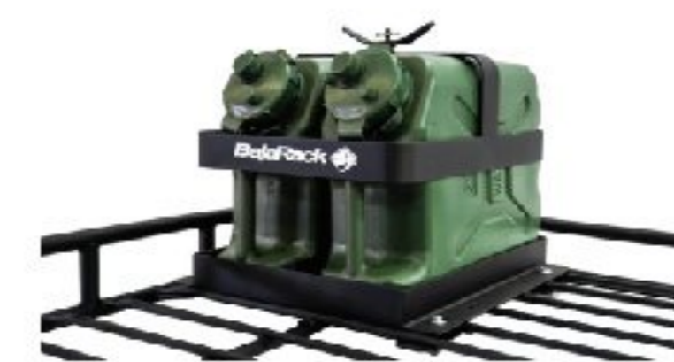
Water Can Holder