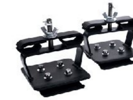
Axe & Shovel mount for flat racks