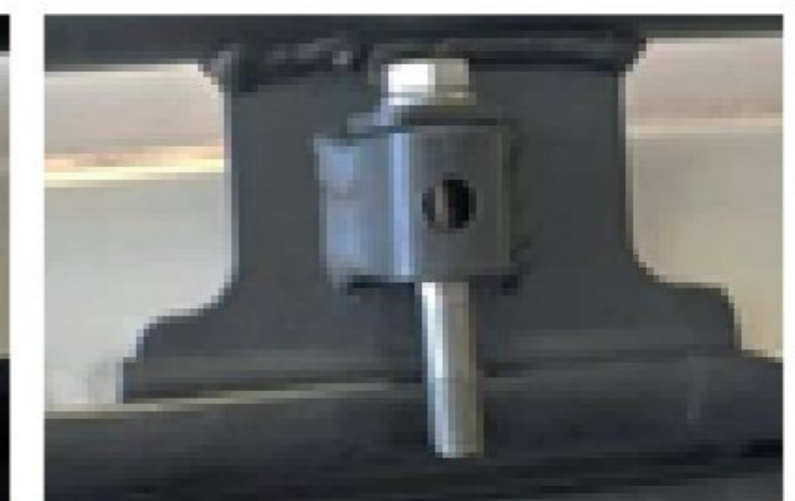
For rear rack brackets (6x)