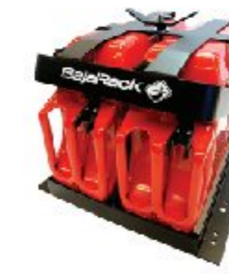
Fuel Can Holder