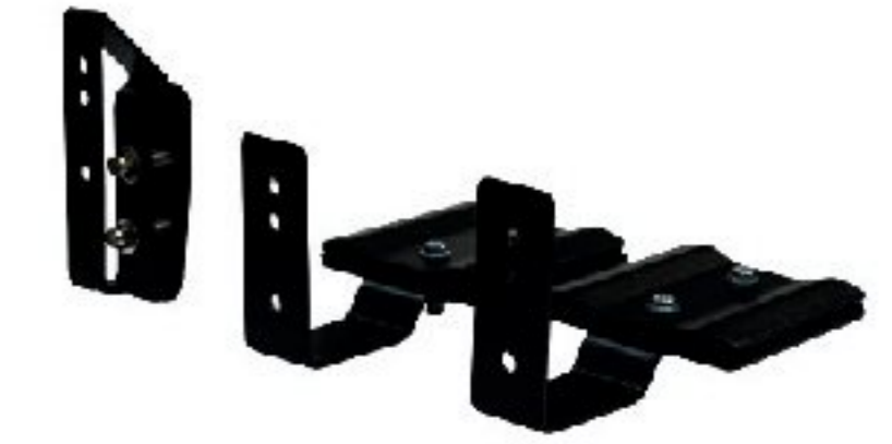
Awning mount for Land Rover Discovery I and Discovery II