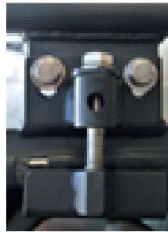
Rear clamps (6x)