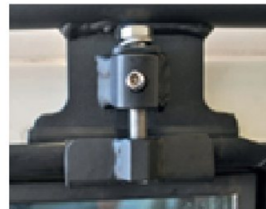
Rear rack brackets