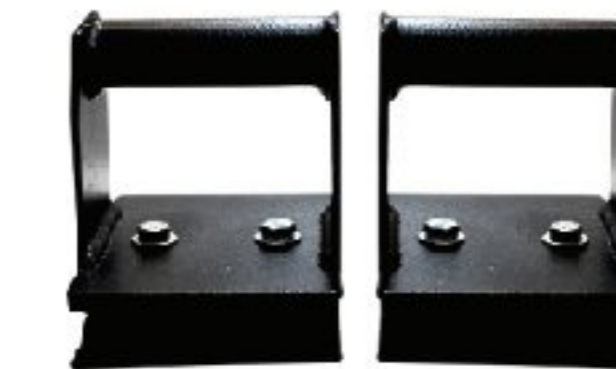
Yakima & Thule Accessory mount (2 pieces)