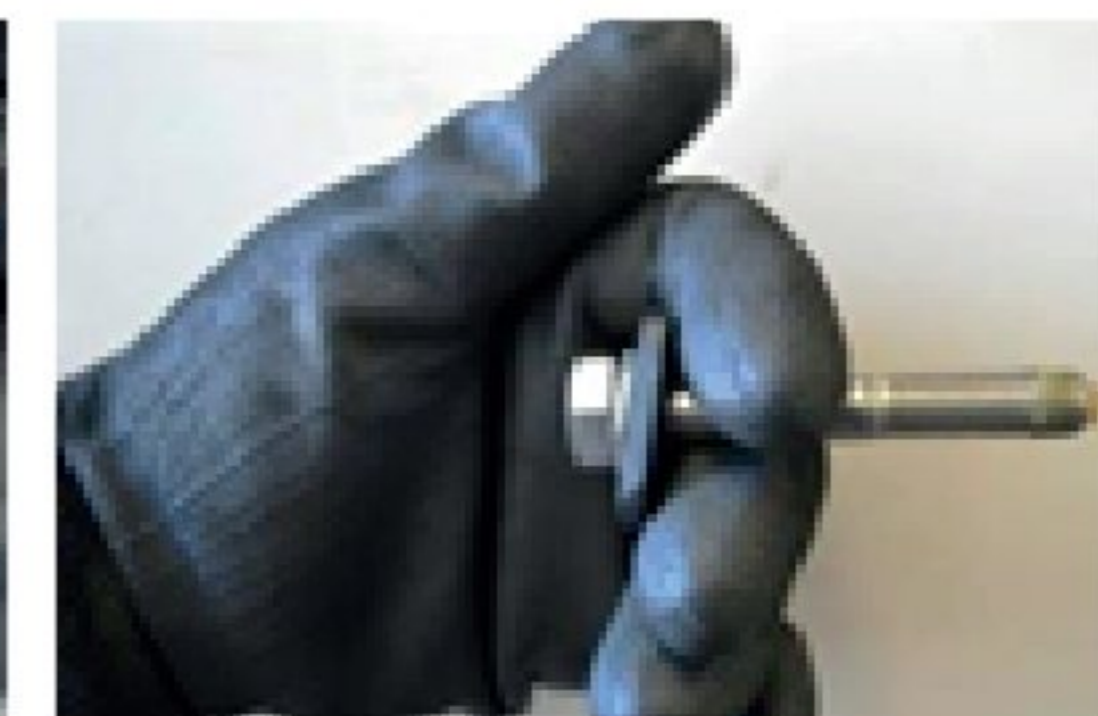
Bolt with grease