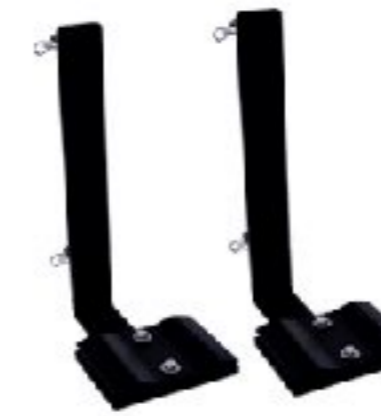
Maxtrax mount for flat racks