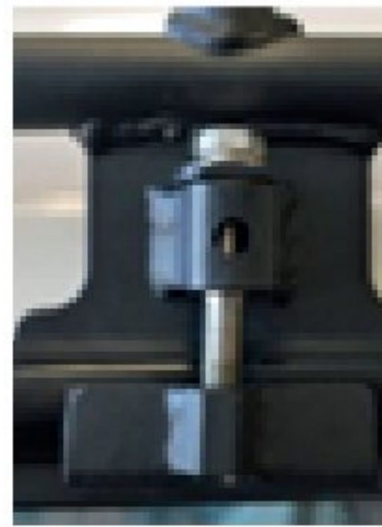
Front clamps (2x)