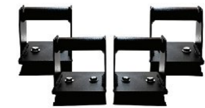
Yakima & Thule Accessory mount (4 pieces)