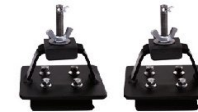
Hi-Lift mount for flat racks