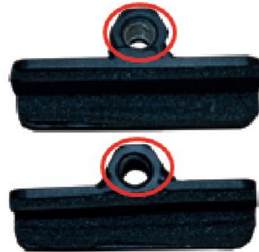
Front clamps (2x)