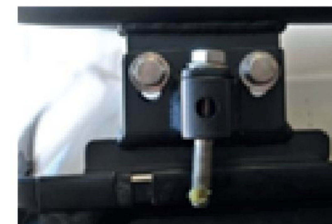
For front rack brackets (2x)