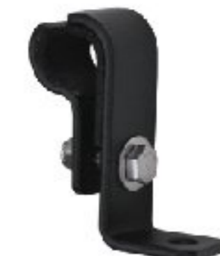
Light Clamp mount