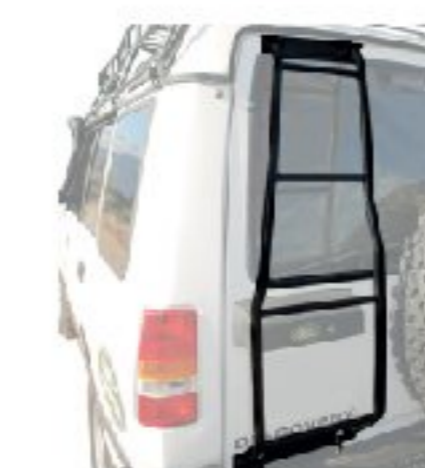
Ladder Land Rover Discovery I & II