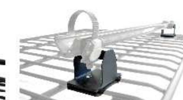
Yakima & Thule Accessory mount (2 pieces)