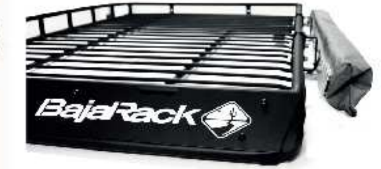
Awning mount for 5" height racks