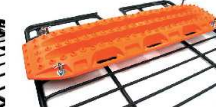
Maxtrax mount for the floor of tubing and mesh racks