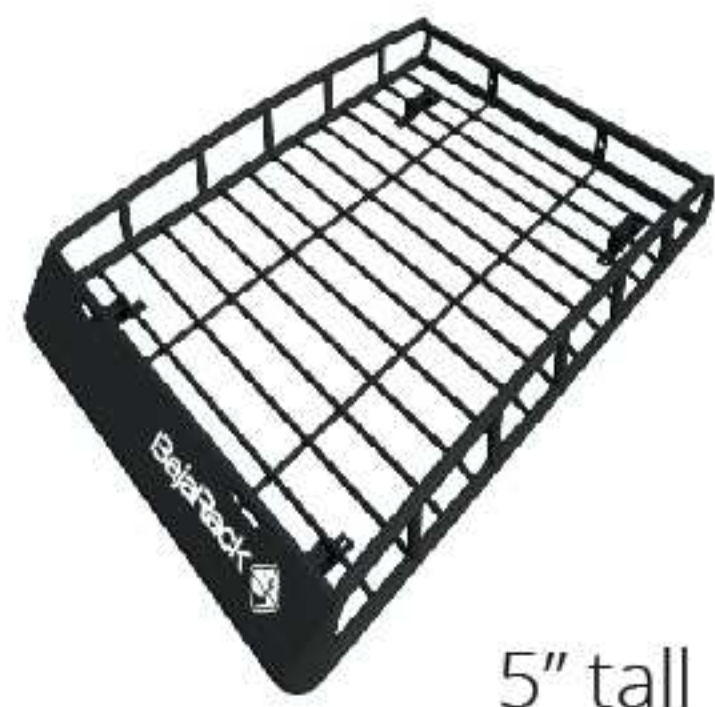
5" tall (127 mm)