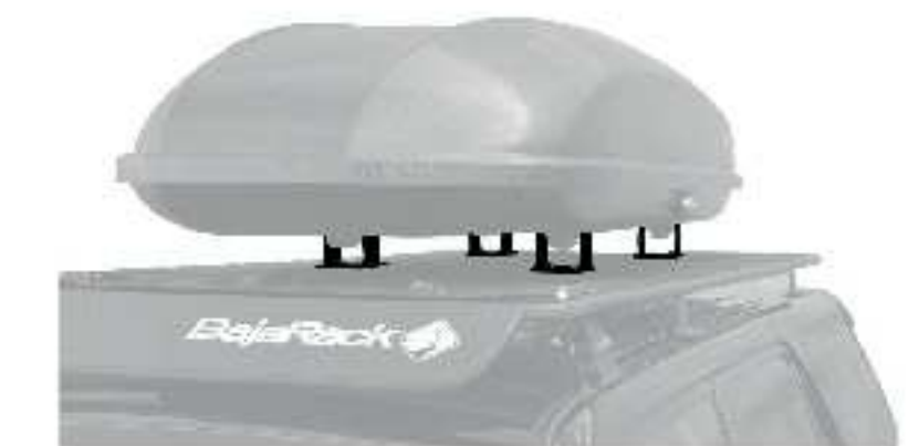
Yakima & Thule Accessory mount (4 pieces)