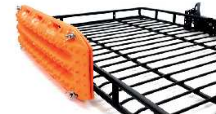
Maxtrax mount for 5" height racks