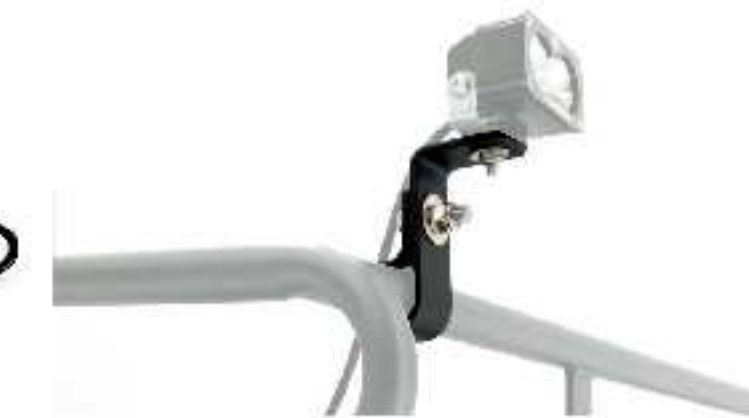
Light Clamp mount