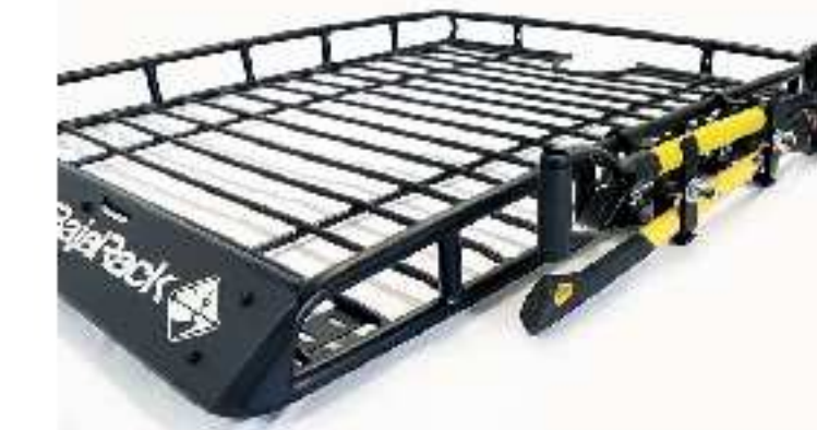
Axe & Shovel mount for 5" height racks