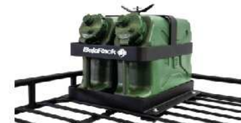
Water Can Holder