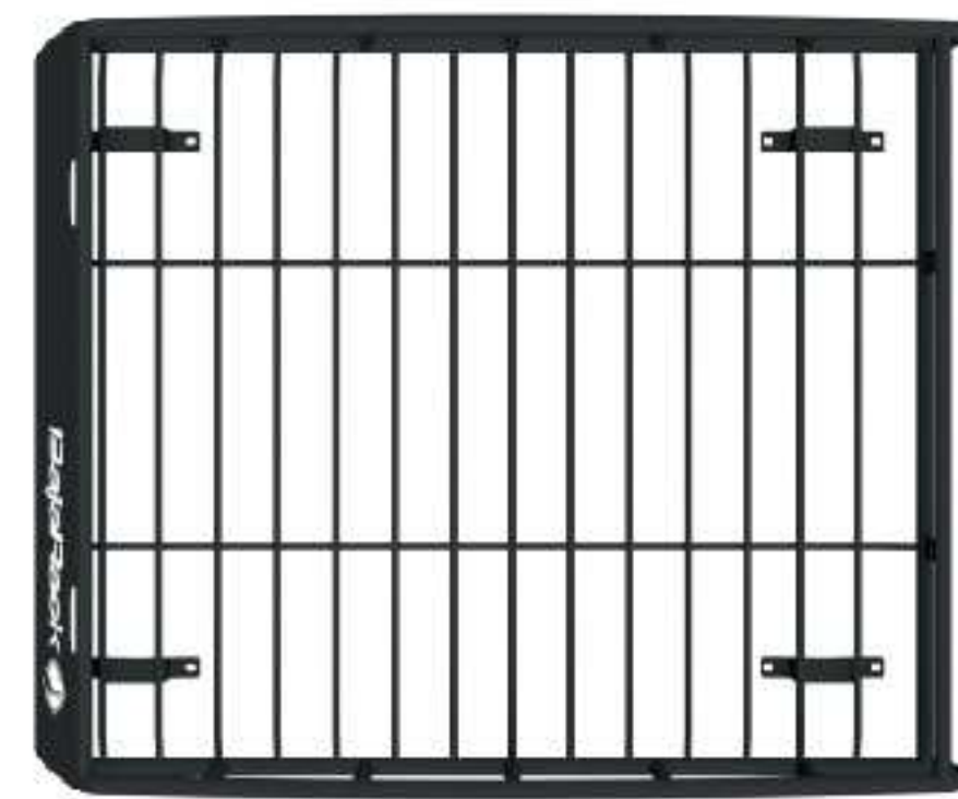
48" (1219.2 mm)

This Rack comes as one piece and includes all mounting brackets, stainless steel hardware, and aluminum wind deflector.