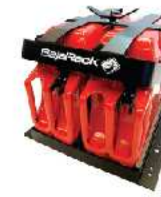
Fuel Can Holder