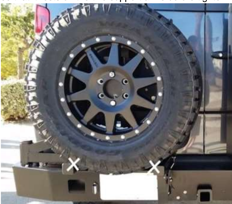
Figure 1. Rest tire on both support arms (before tightening the lugs or U-bolts down). *NOTE* Your bumper may look different than the one seen in the above picture.