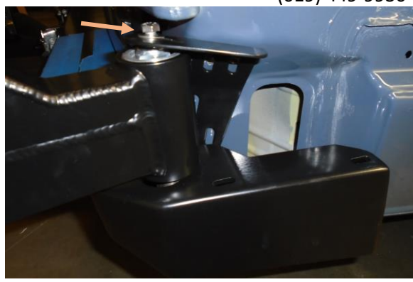
Figure 10: Pre-Mounting Axle Support Brackets

11. Install the axle support brackets (see "Additional Parts") loosely onto the axle of the rear bumper using the 3/8" x 1" bolt. Reference Figure 10.