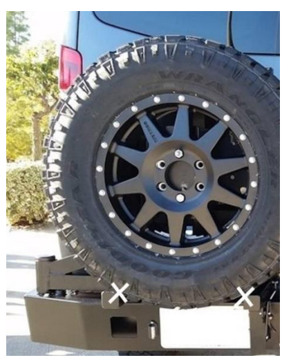
Figure 16: Tire Resting Correctly on Swing Arm