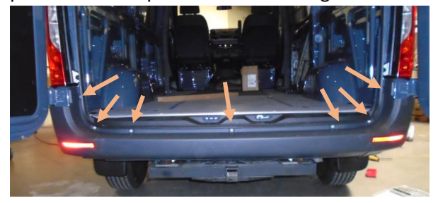
Figure 2: Torx Bolts on the Rear Bumper

3. Remove the seven (7) torx bolts holding on the plastic rear bumper as indicated in Figure 2: