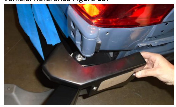
Figure 13: Installation of the Trim Assembly

16. Install the trim assemblies temporarily to verify clearances around axle system and fitment onto vehicle. Reference Figure 13.