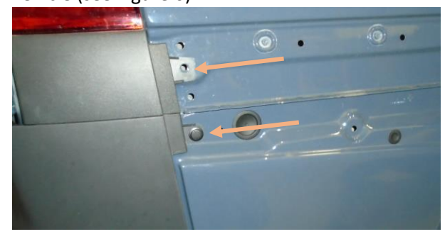
Figure 6: Plastic Rivets Underneath the Side Panel

Remove the plastic rivets anchoring the plastic rear bumper assembly on both sides of the vehicle (see Figure 6).