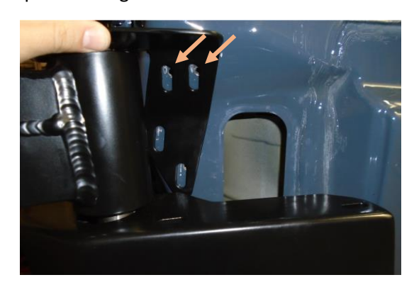
Figure 11: Drilling for Axle Support Bracket

PRO TIP: Use painter's masking tape to protect bumper as swing arm from drill.