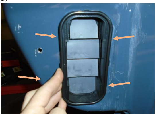
Figure 9: Air Pressure Relief Insert Removal