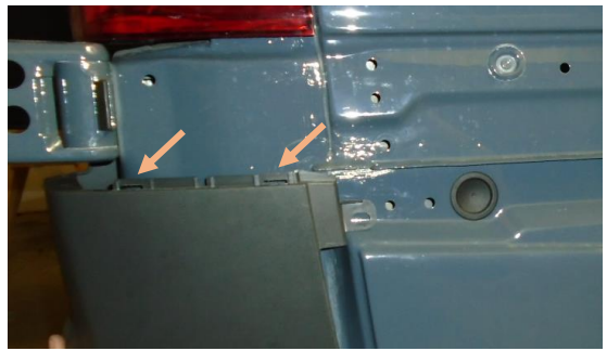
Figure 8: Small Plastic Panel Removed