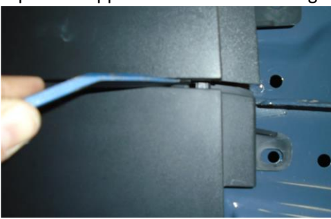
Figure 7: Removing Small Plastic Panel from Rear Bumper

7. Disconnect the tabs connecting the smaller plastic panel on top from the plastic rear bumper. Once disconnected, gently pull away from vehicle to remove. Retain small panel and repeat on opposite side. Reference Figures 7-8.