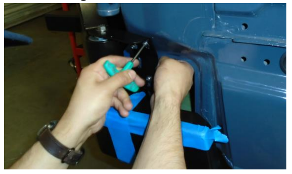
Figure 12: Tightening Hardware Through Insert Opening

Tighten 3/8" bolt on top of axle as well. Reference Figure 12.