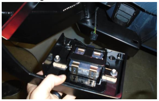
Figure 14: Blind Spot Sensor Installation