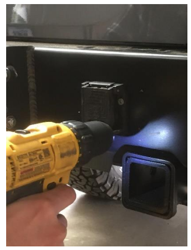
Figure 15: Installation of the trailer plug