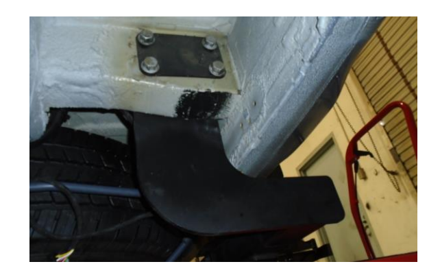
Figure 1: Four (4) of the Hitch Mounting Bolts