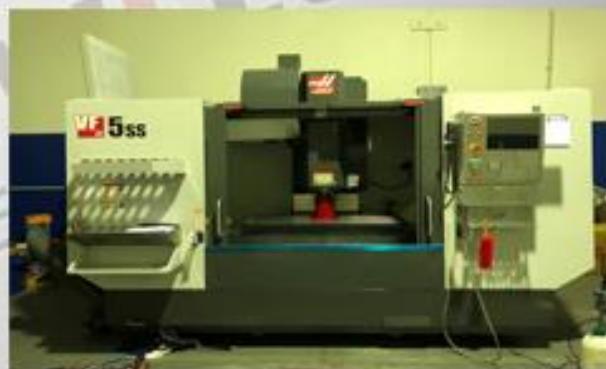
Swiftek advocates constant growth & improvement to keep up with technology & trends