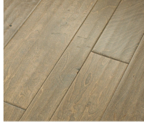
1023 Crescent Beach