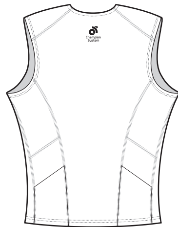
: Back View :