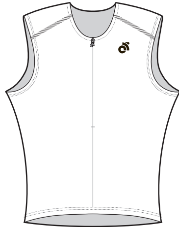
: Front View : [ MLJ030 / MLJ043 ]