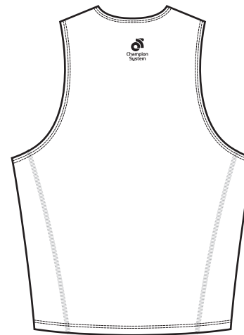
: Back View :