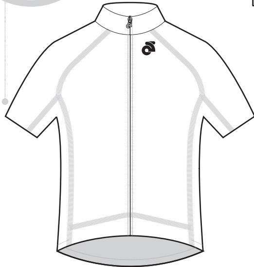
: Elite/ Apex Razor 2.0 : ( MSJ104 )