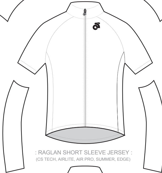
: RAGLAN SHORT SLEEVE JERSEY : (CS TECH, AIRLITE, AIR PRO, SUMMER, EDGE)