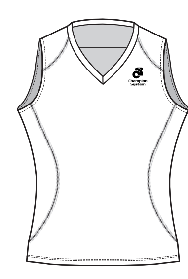
: Women Specific Run Singlet : (Apex WUJ023/ Performance WUJ043)