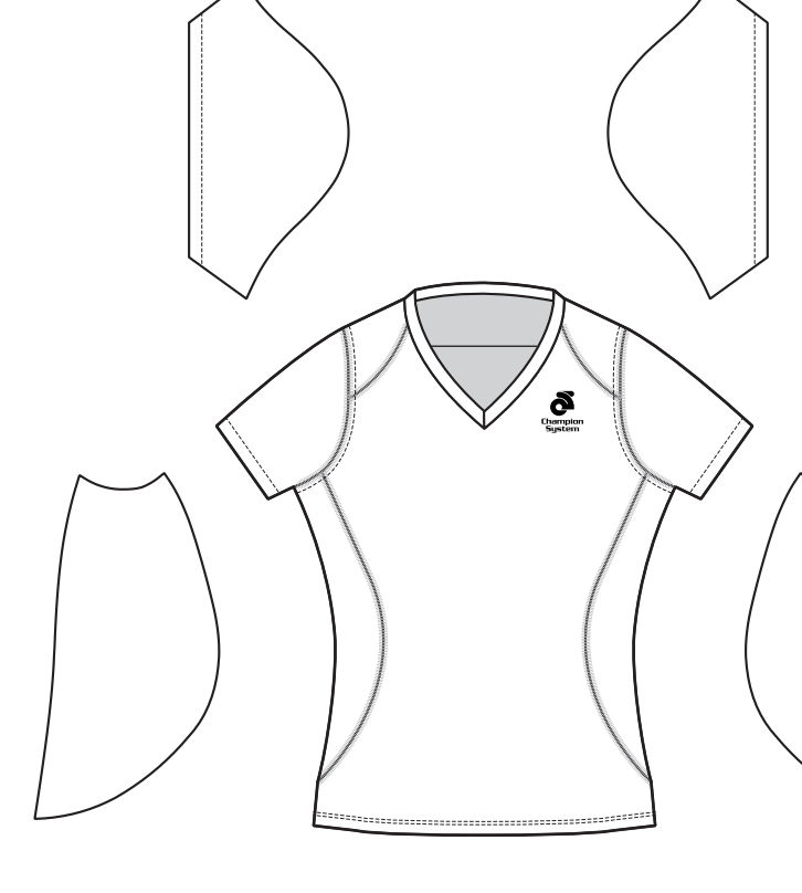
: Women Specific Run Top : (Apex WUJ025/ Performance WUJ045)