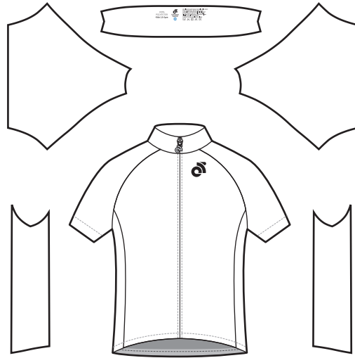
Kids Tech Jersey [ KIJ001 ]