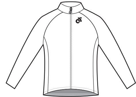
Kids LS Tech Jersey [ KIJ003 ]