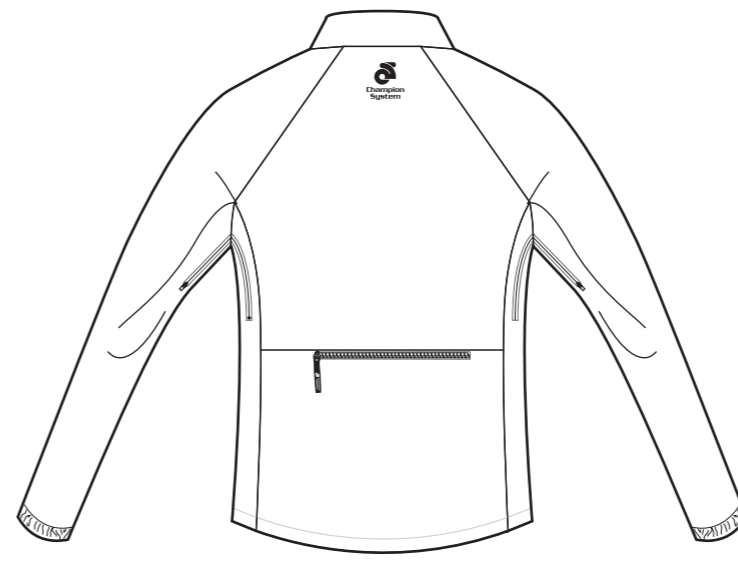
: WIND GUARD JACKET :