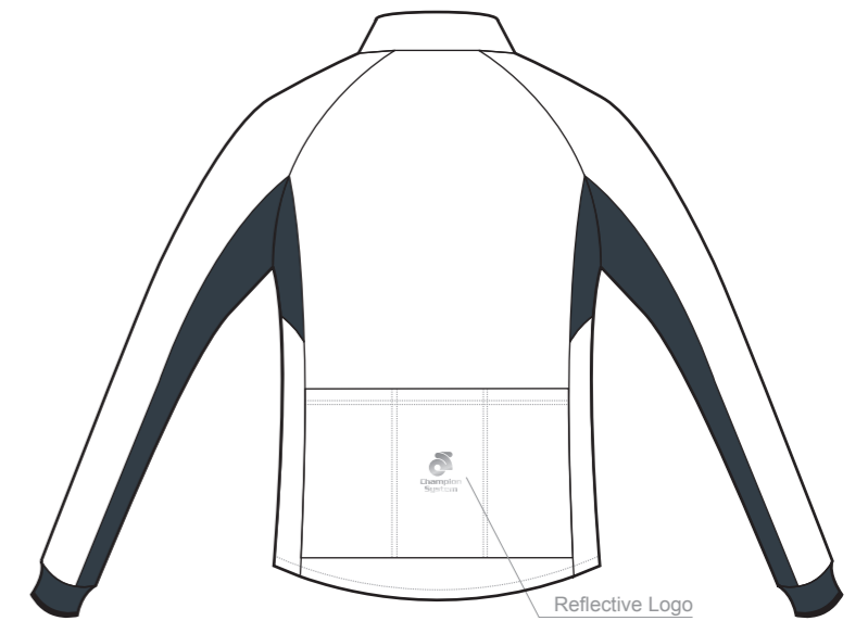
: CS APEX Winter Shield Fleece Jacket : MTF052

TeamName_USXXXXXX_JAK002_Normal_V1.01 Graphic Editor: Name Start Date: 2000/00/00 End Date: 2000/00/00