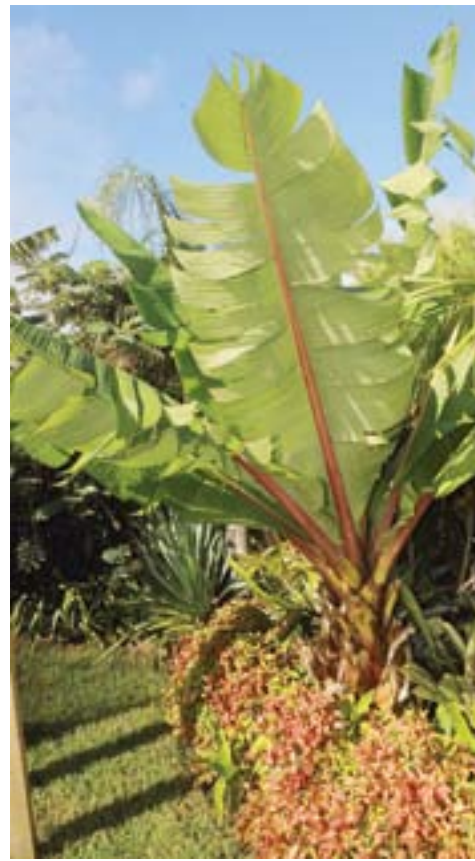
Palms add shade to a tropical garden.

The fences surrounding the garden are covered with bamboo panels which