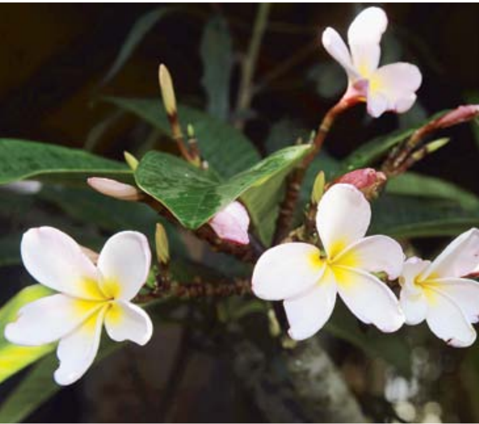
Frangipanis can grow in Melbourne with the right care.

Plants that do well in Melbourne include cocos palms, bangalow palms, cotton palms, Chinese windmill palms, abyssinian banana palms, bromeliads, cordylines, canna lilies and palm grasses.