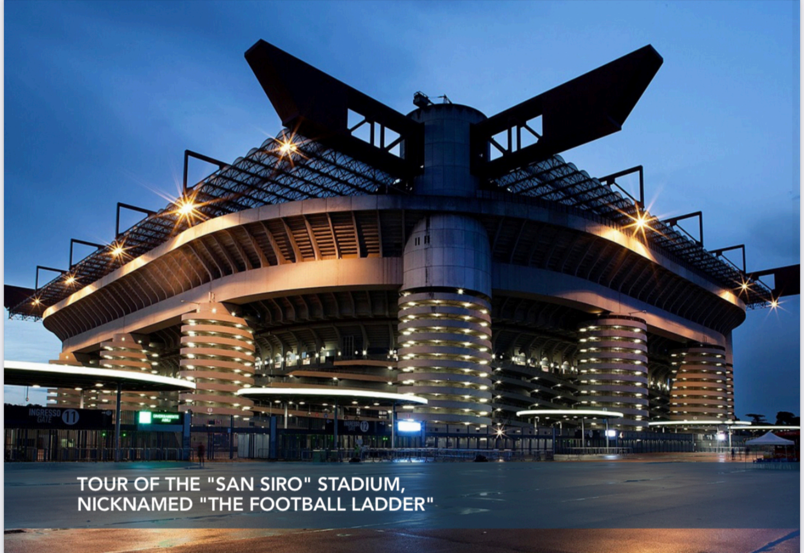
TOUR OF THE "SAN SIRO" STADIUM, NICKNAMED "THE FOOTBALL LADDER"